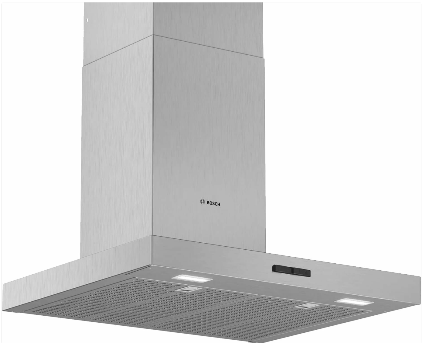
Figure 1: Bosch DWB64BC52 Wall-Mounted Cooker Hood.

Please read these instructions carefully before installation and use, and keep them for future reference.