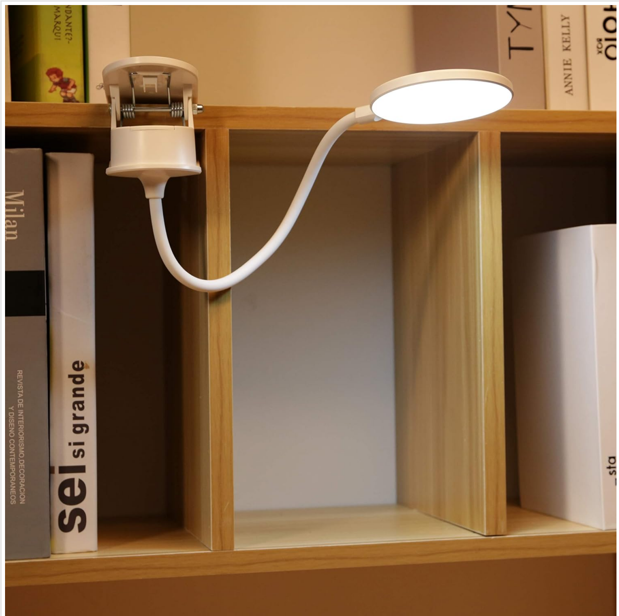
Image 3.1: The Miady Clip-on Lamp securely attached to a wooden shelf, demonstrating its versatility.