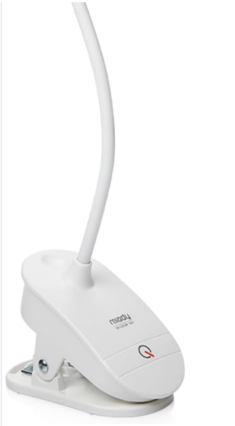
Image 1.1: The Miady Clip-on Lamp Model LDL04, showcasing its flexible neck and clip base.