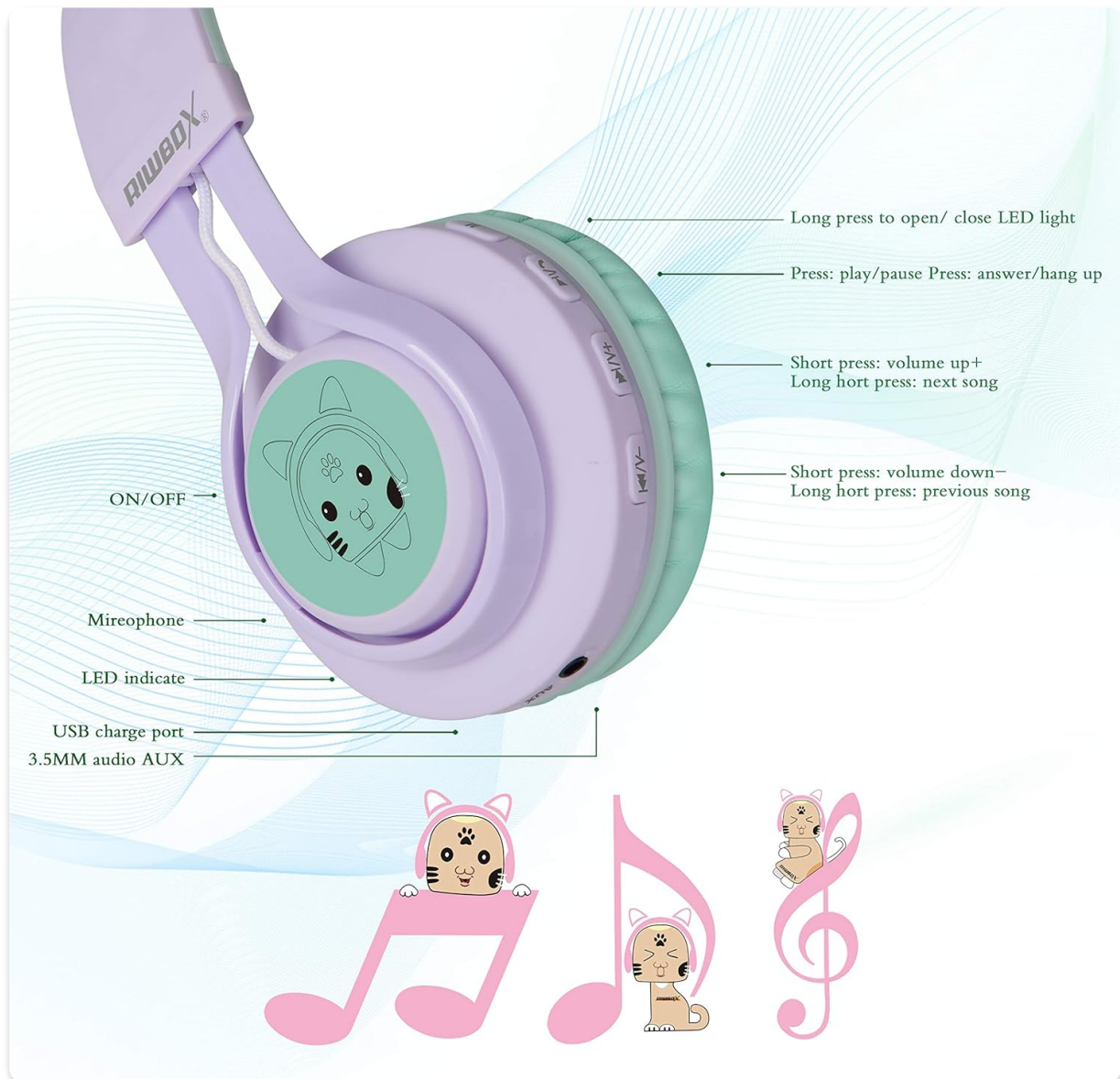
Image: Detailed diagram showing the location of the ON/OFF switch, microphone, LED indicator, USB charge port, and 3.5mm audio AUX port on the headphones.

6. The connection status and battery level will be shown on your smartphone screen.