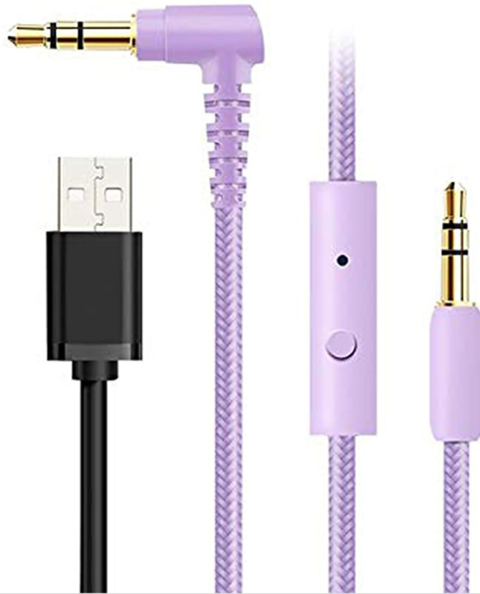
Image: The included 3.5mm audio cable and USB-C charging cable.