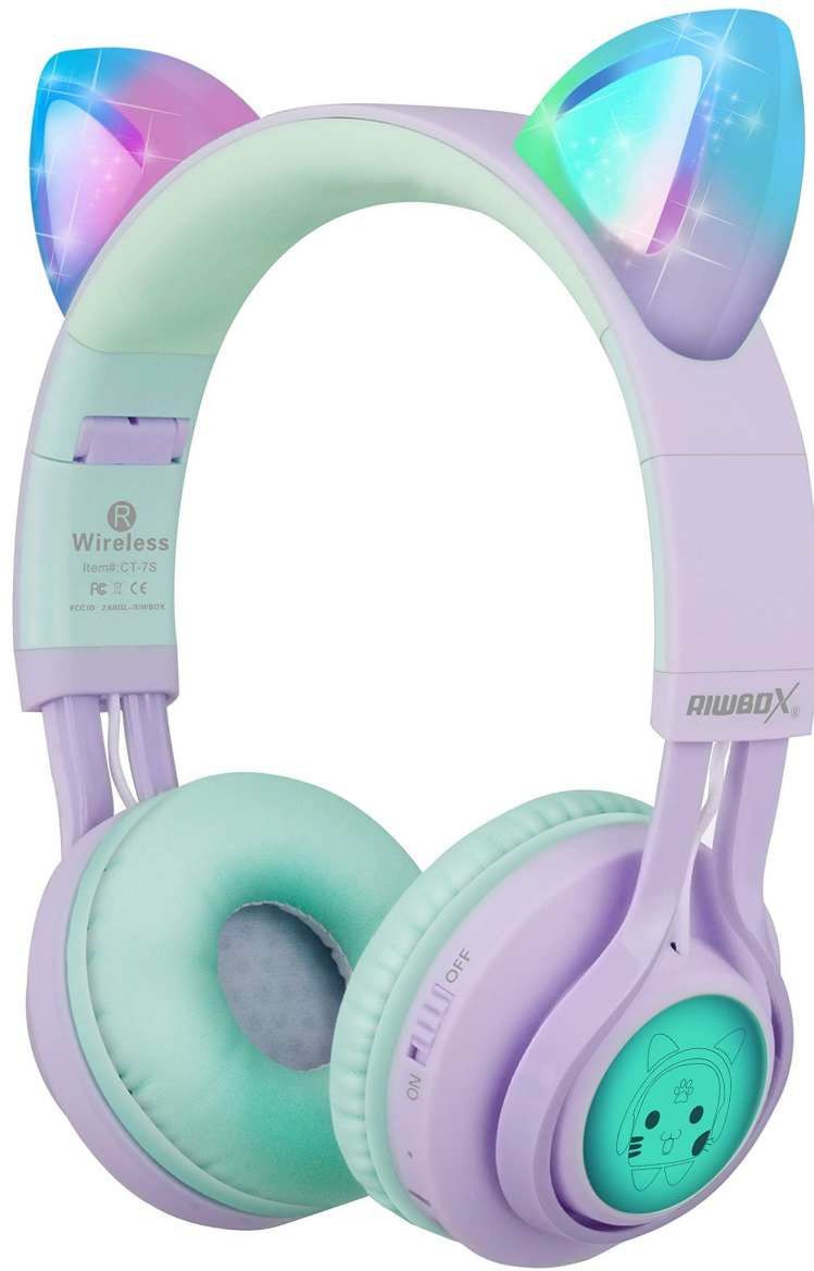
Image: Riwbox CT-7S Kids Wireless Headphones in purple and green, showcasing the cat-ear design and soft earcups.