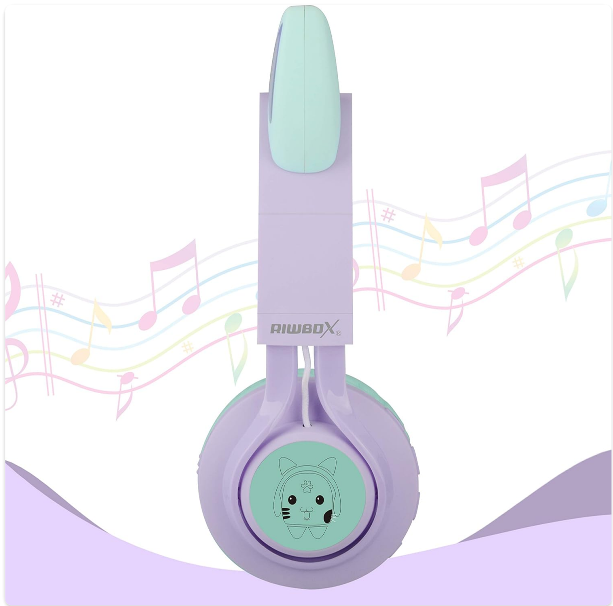
Image: Riwbbox CT-7S headphones shown in their folded position, highlighting portability.