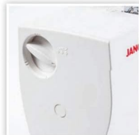
EASY ACCESS FOOT PRESSURE DIAL