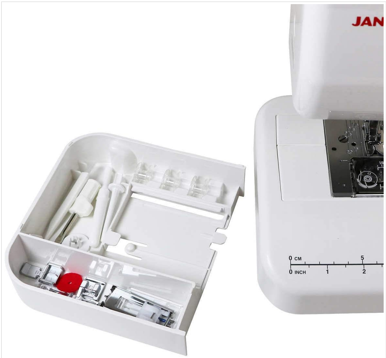
Image: View of the accessory storage compartment, showing various presser feet and tools included with the machine.