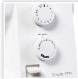
HANDY STITCH CONTROLS