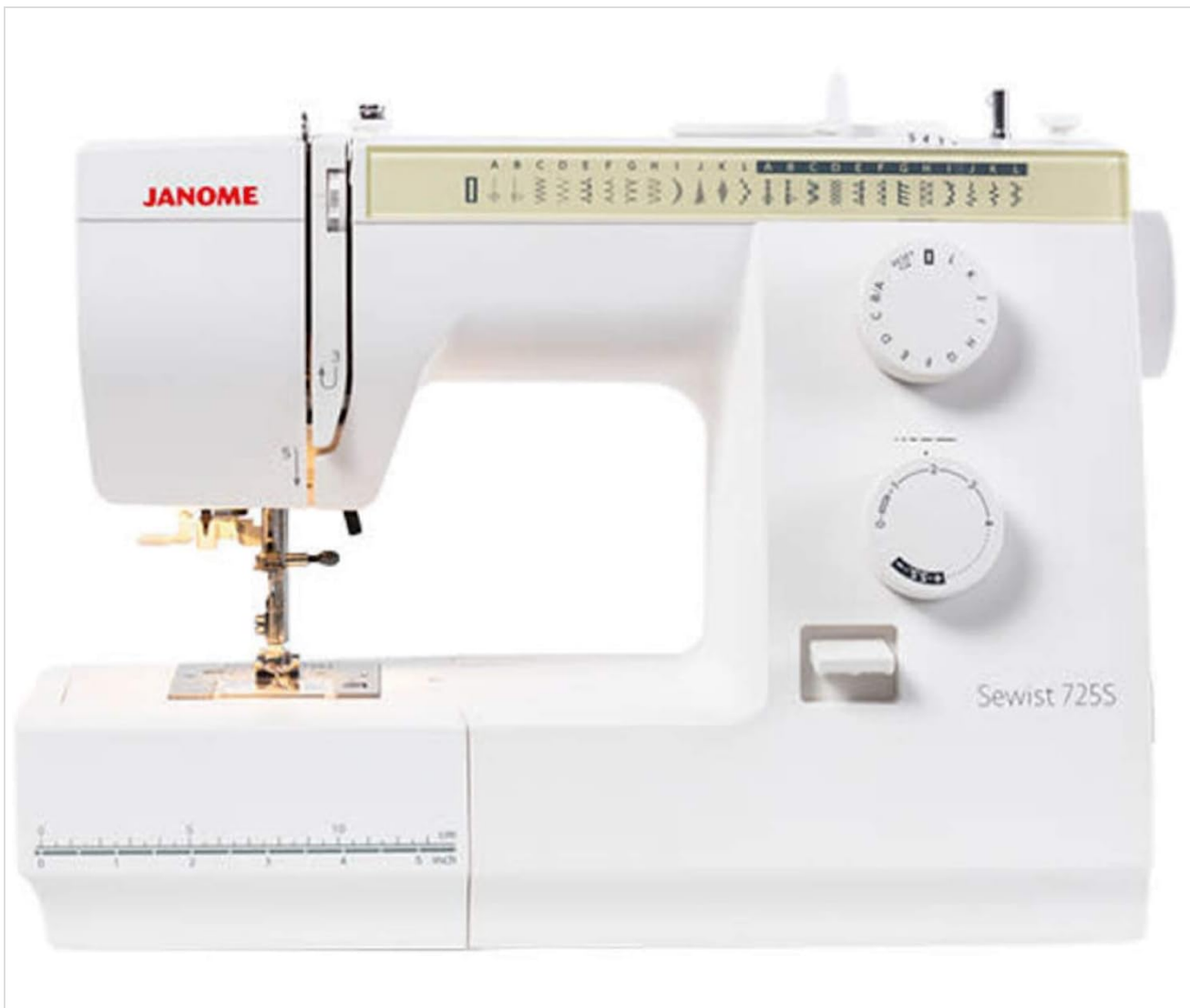
Image: Front view of the Janome Sewist 725S sewing machine, showcasing its compact design and main controls.

The Janome Sewist 725S is a robust and reliable mechanical sewing machine designed for a wide range of sewing projects, from mending to crafting and home décor. Its heavy-duty metal frame ensures stable operation and durability. This manual provides essential information for setting up, operating, maintaining, and troubleshooting your machine to ensure a smooth and enjoyable sewing experience.