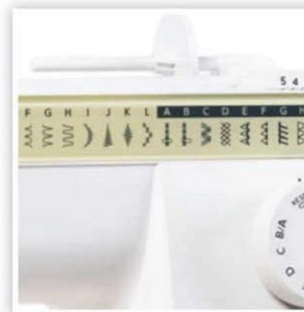
25 STITCHES INCLUDING ONE-STEP BUTTONHOLE