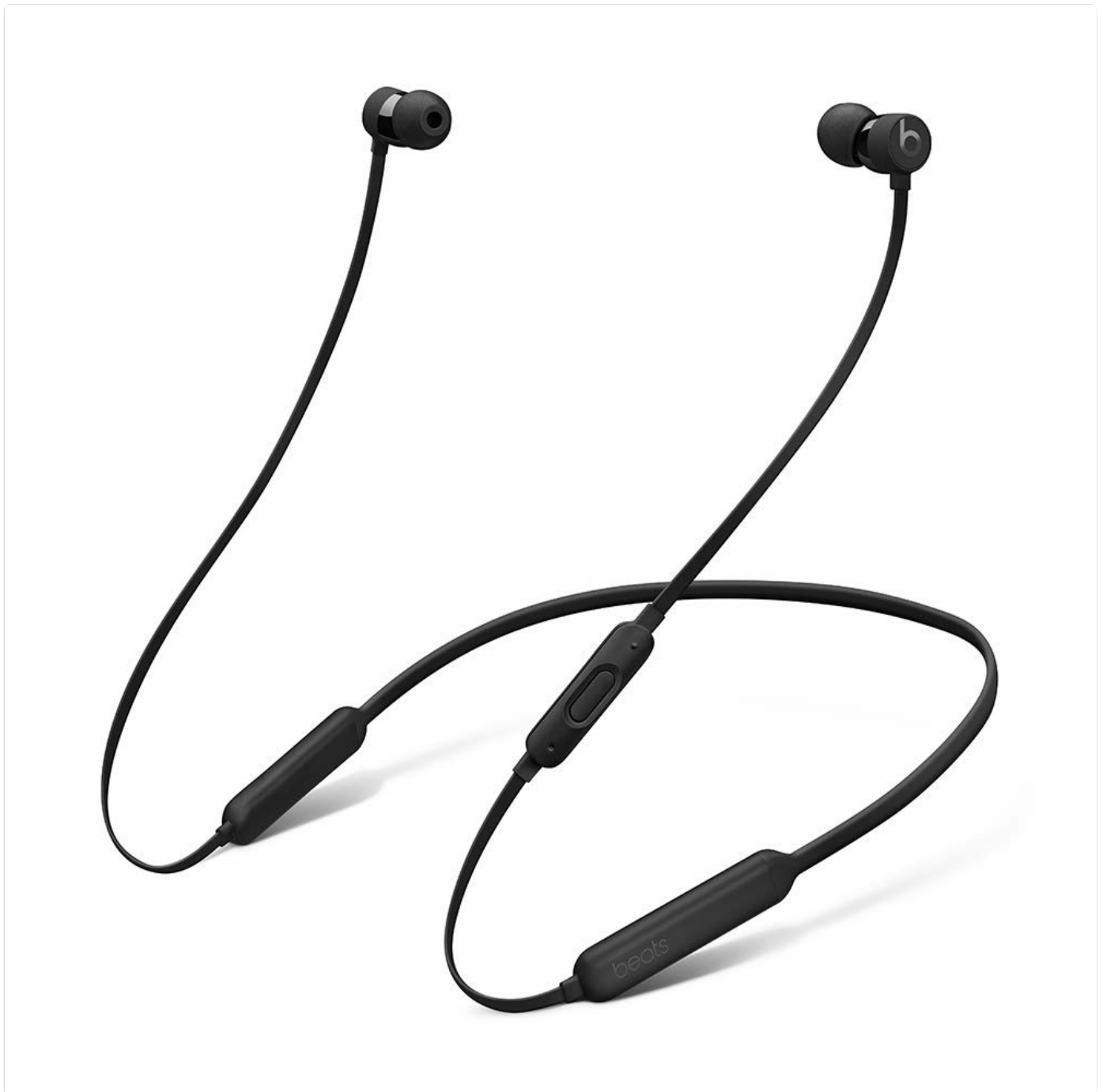
Image: BeatsX Wireless Earphones, displaying the complete product with neckband, earbuds, and control module.