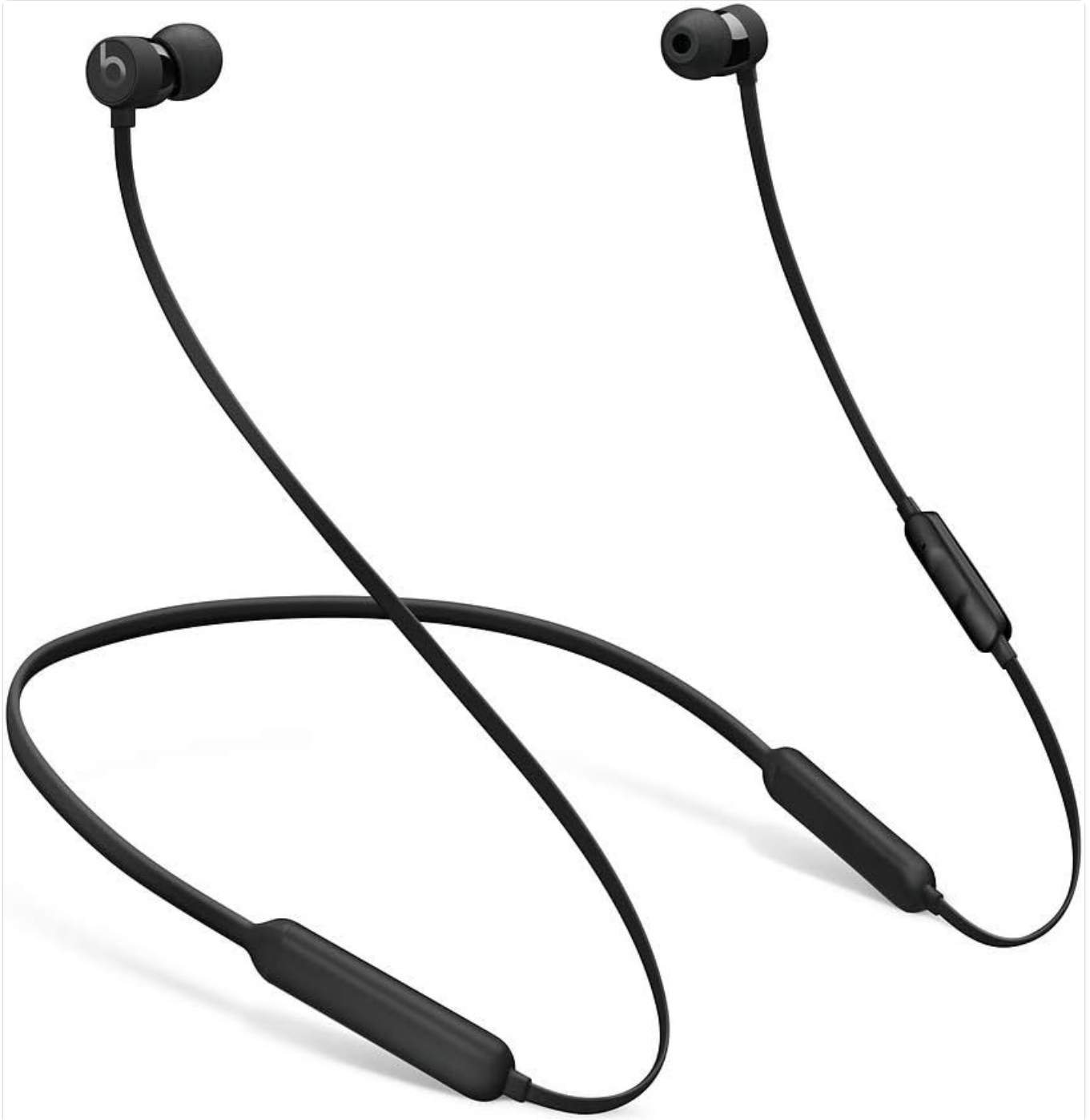
Image: BeatsX Wireless Earphones shown in a wearing position, highlighting the flexible neckband.

The Flex-Form cable is designed for comfort and flexibility. Place the neckband around your neck and insert the earbuds into your ears. Adjust the cable for a secure and comfortable fit. The magnetic earbuds can clasp together for easy storage around your neck when not in use.