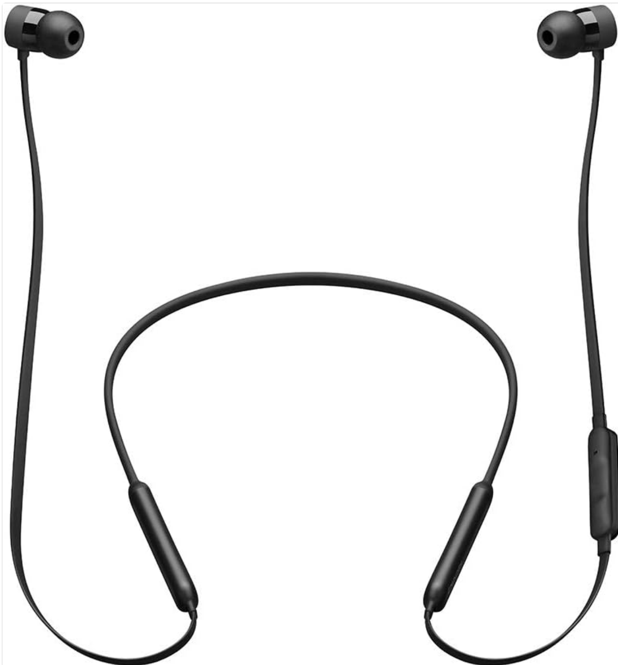
Image: The magnetic earbuds of the BeatsX earphones are shown clasped together, illustrating their compact storage feature.

portability. The magnetic earbuds help prevent tangling.