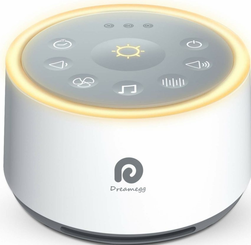
The Dreamegg D1 Sound Machine with its intuitive control panel and soft night light.