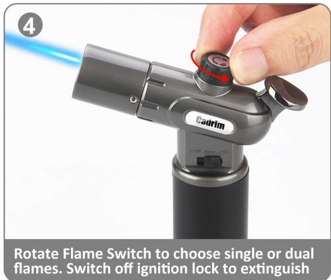
Figure 2: Step-by-step guide on operating the Cadrim Butane Torch.