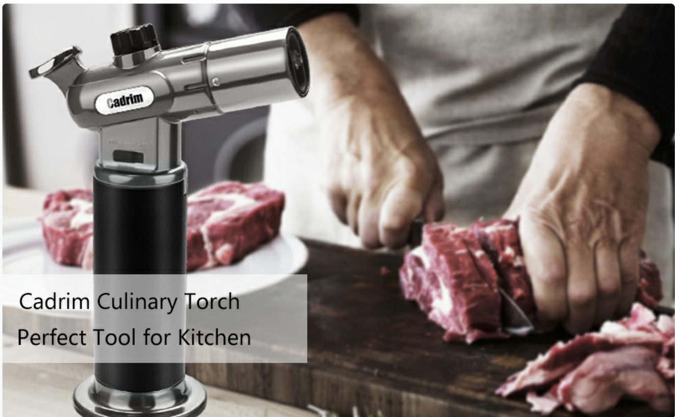
Figure 4: The Cadrim Cooking Torch offers a powerful double flame.