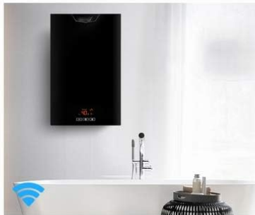
Water heater control