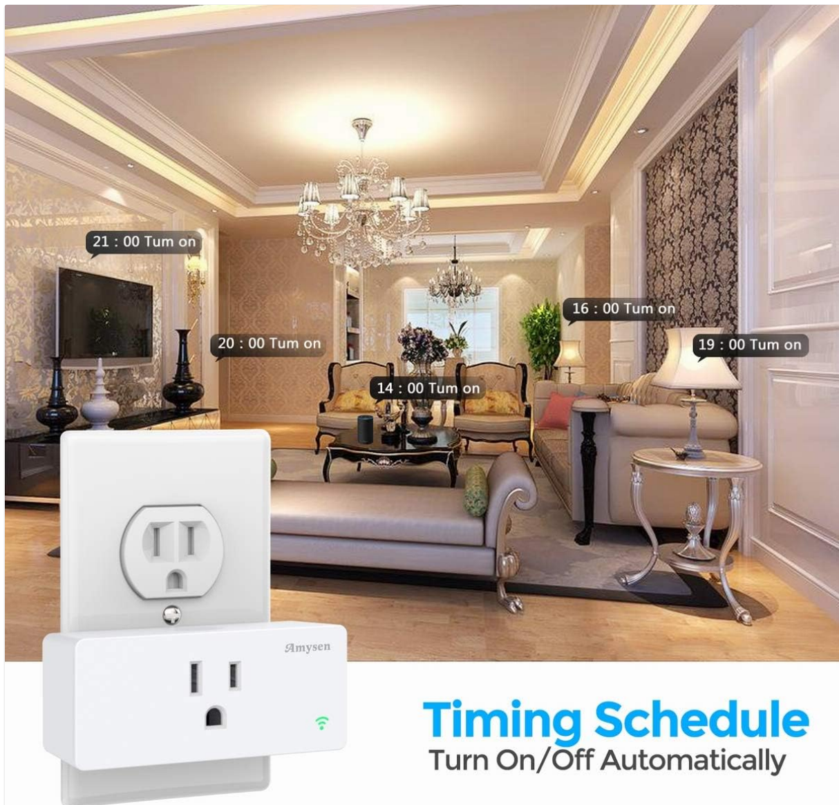
Figure 5: Example of timing schedules for automatic device control in a home environment.