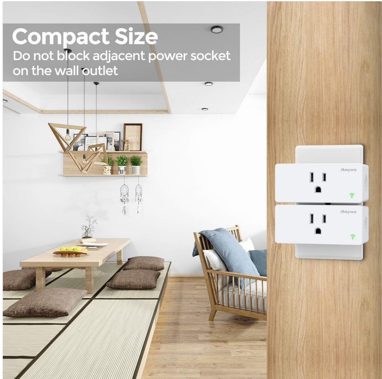
Figure 2: The compact design of the Amysen Smart Plug, demonstrating that it does not obstruct the adjacent power socket.