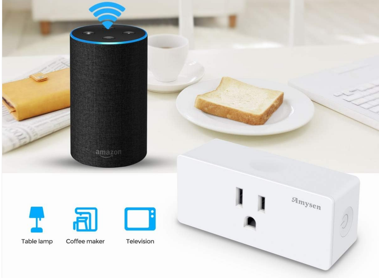
Figure 3: Hands-free voice control with the Amysen Smart Plug, compatible with Amazon Alexa and Google Home.