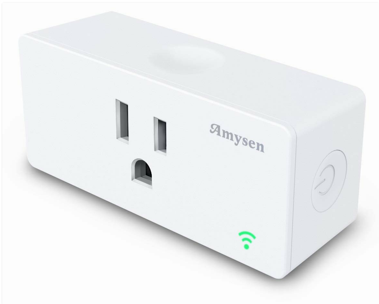
Figure 1: Front view of the Amysen Wifi Smart Plug, showing the standard US outlet configuration and the Amysen logo.