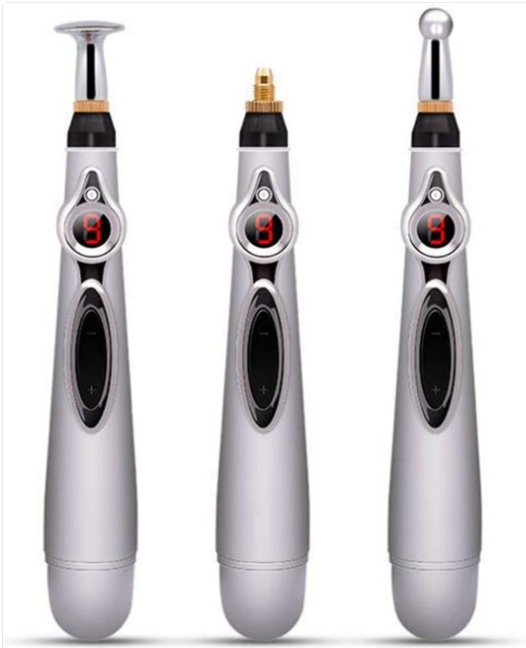
Figure 3: The three interchangeable massage heads: Node Type (left), Dome Type (middle), and Spheroidal Type (right).