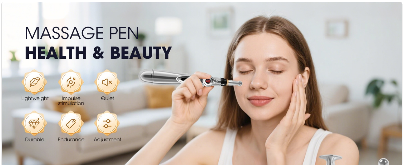
Figure 1: The Electronic Acupuncture Pen showing its adjustable intensity from 1 to 9. Initial use is suggested at gear 2-3.

Familiarize yourself with the components of your Electronic Acupuncture Pen: