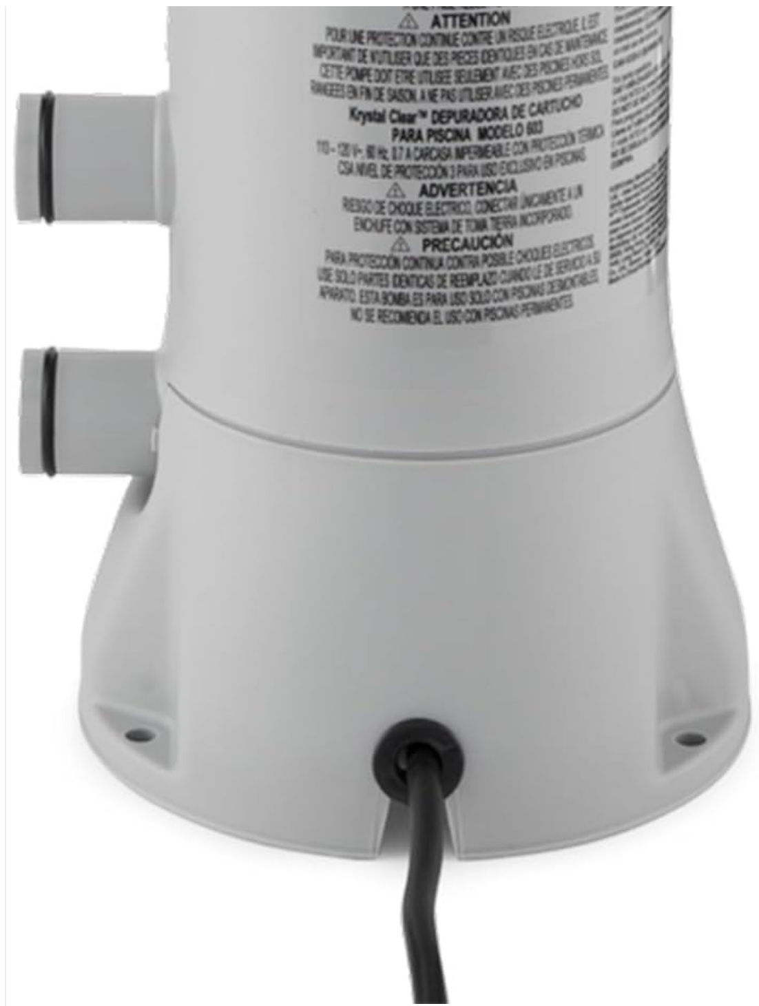
Figure 3.2: Rear view of the pump, highlighting the power connection and product information label.