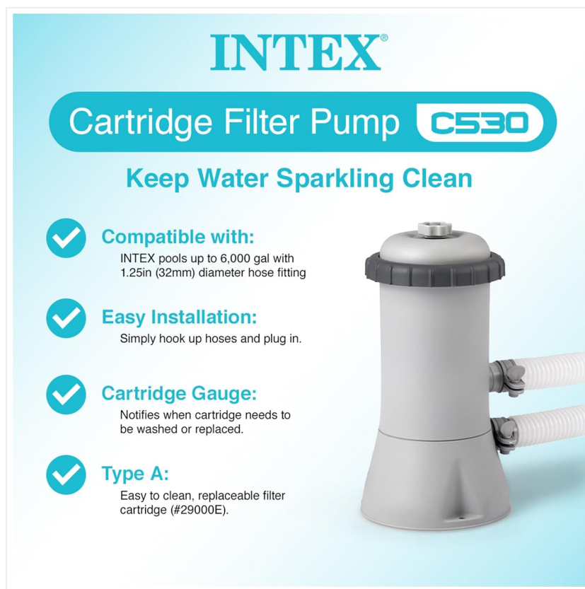
Figure 6.1: The Type A filter cartridge, essential for trapping impurities.