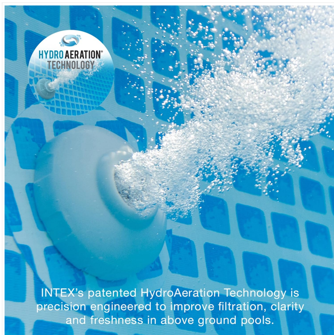
Figure 5.1: The Hydro Aeration outlet actively introducing air bubbles into the pool water, enhancing water quality.

Video 5.1: Demonstration of Intex Hydro Aeration Technology, showing how air is introduced into the pool water to improve circulation, filtration, and clarity.