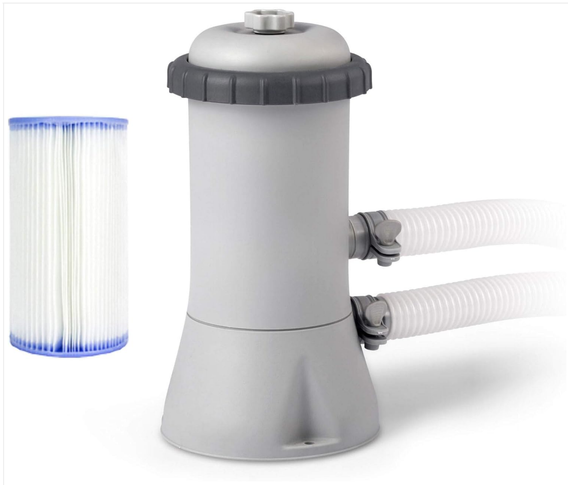
Figure 1.1: The Intex C530 Krystal Clear Cartridge Filter Pump alongside a Type A filter cartridge.