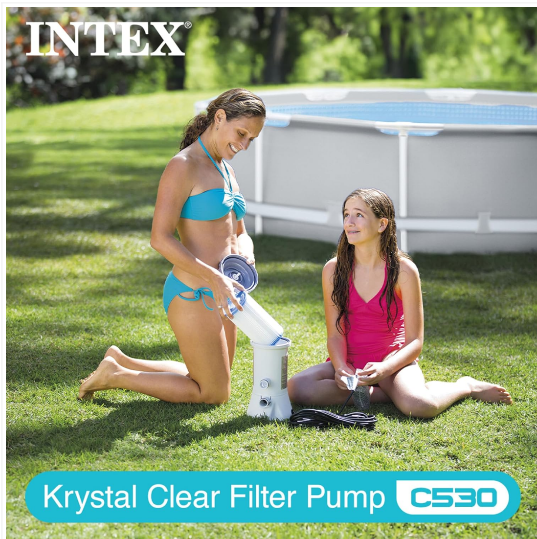
Figure 6.2: Illustration of filter cartridge maintenance.