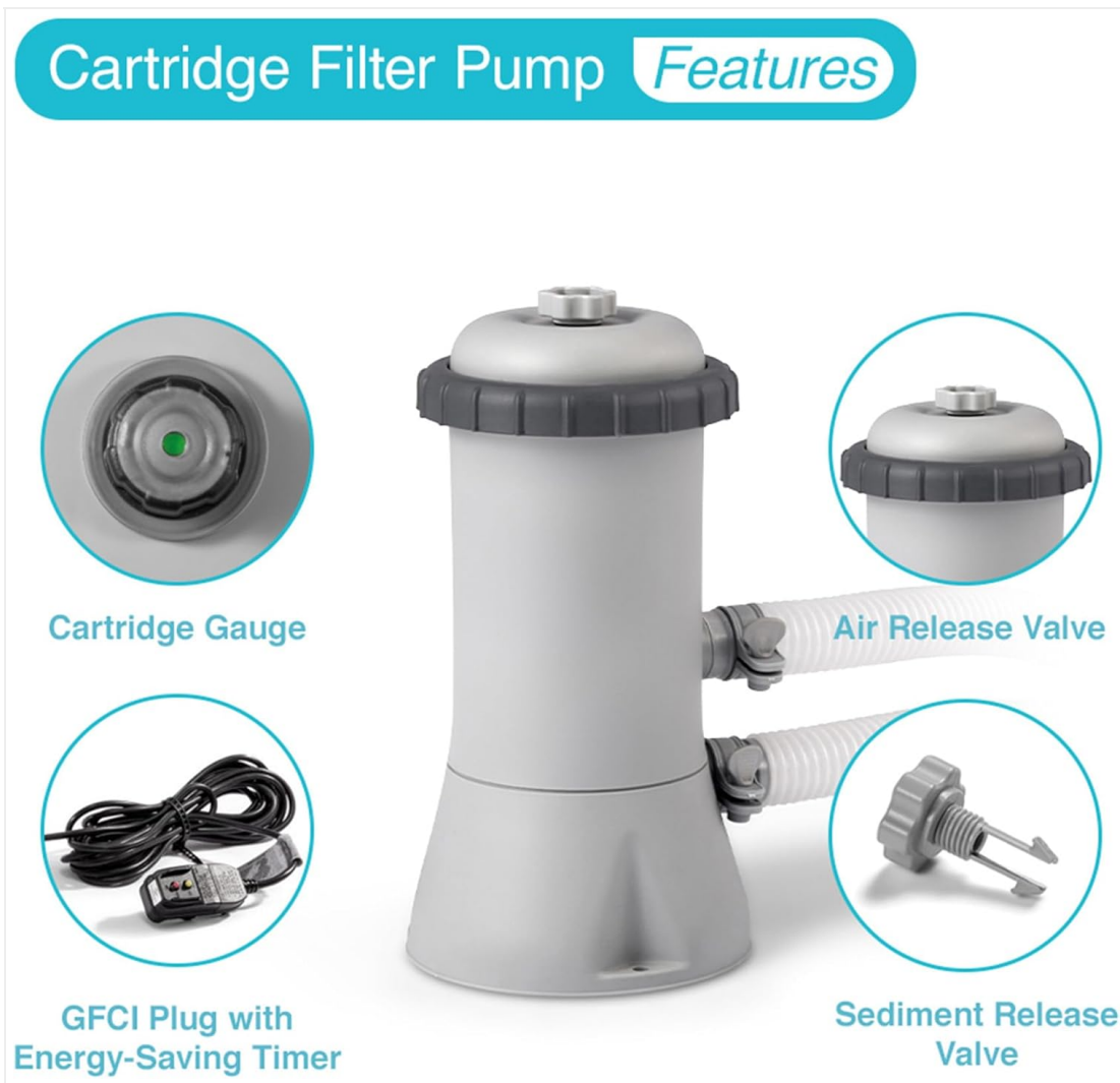
Figure 3.1: Key features and components of the Intex C530 Krystal Clear Cartridge Filter Pump.