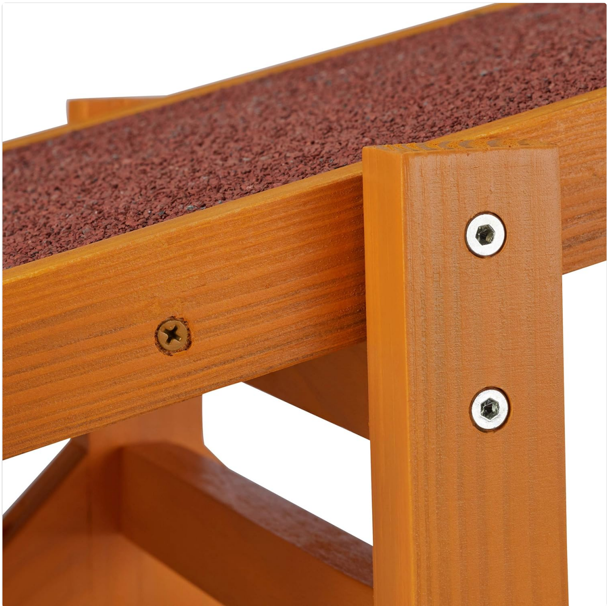
Figure 2: Detail of the seesaw's non-slip rubber surface and sturdy wooden construction.