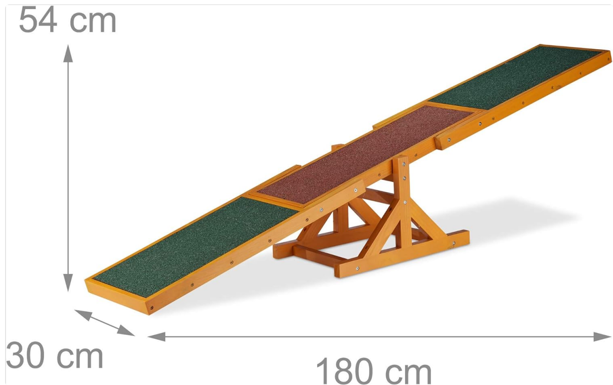
Figure 1: Dimensions of the Relaxdays Pet Agility Seesaw. The seesaw measures approximately 180 cm in length, 30 cm in width, and reaches a maximum height of 54 cm.