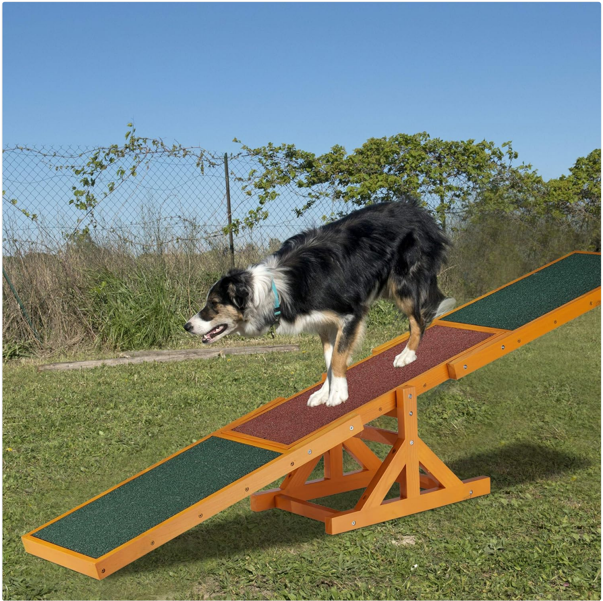
Figure 3: The fully assembled Relaxdays Pet Agility Seesaw in use by a dog.