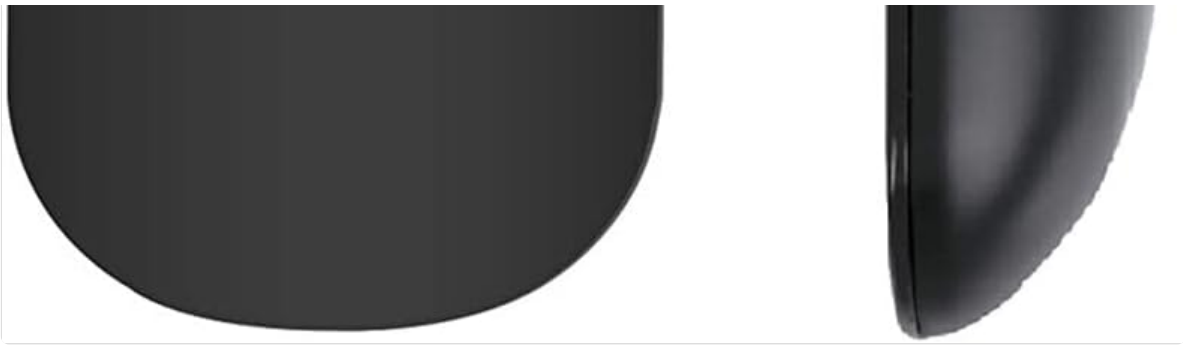
Figure 2: Front view of the remote control with button layout.