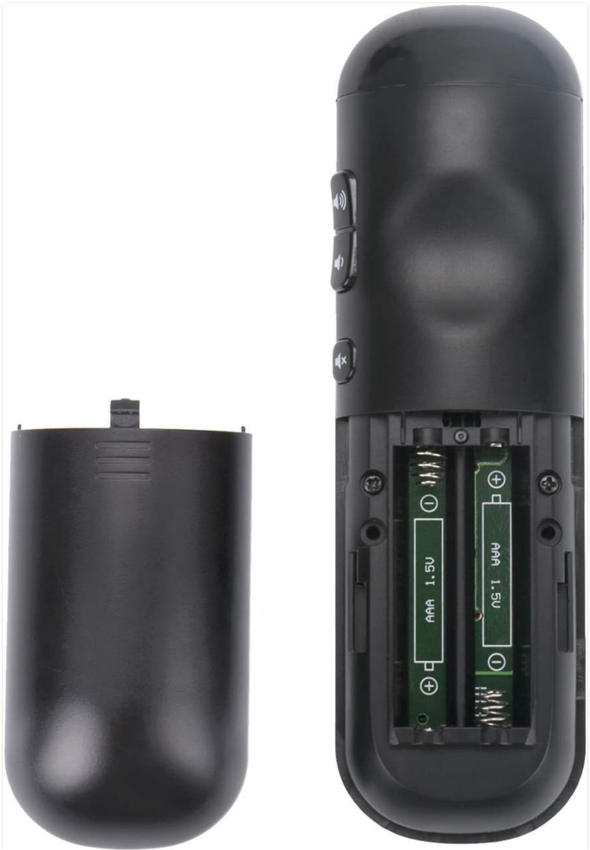
Figure 1: Battery installation. Insert two AAA batteries, matching polarity.