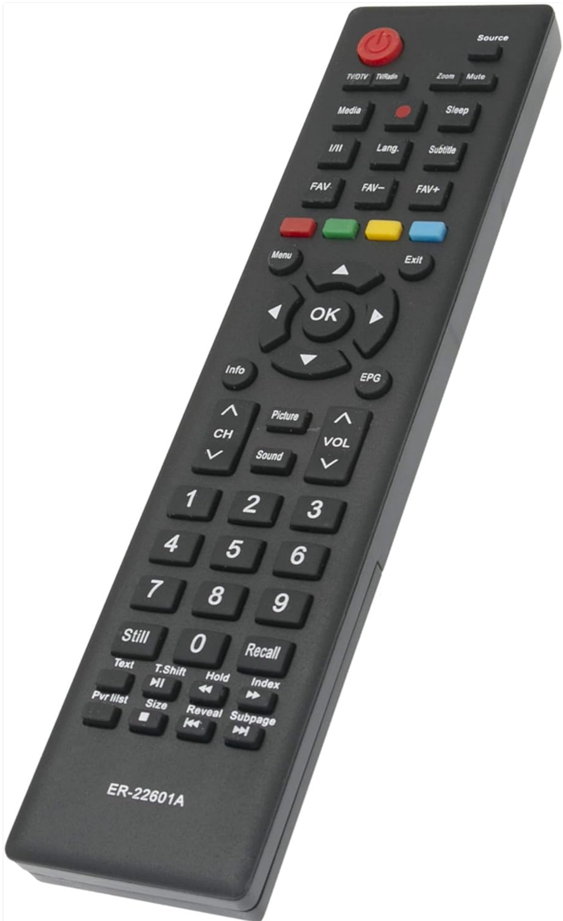
Image: The VINABTY ER-22601A remote control, displaying its full button layout. The battery compartment is located on the reverse side.