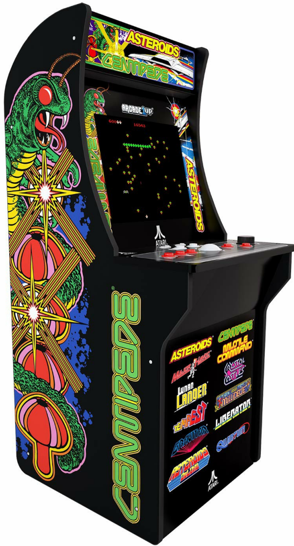
Image: Front view of the Arcade1Up cabinet featuring Centipede artwork on the side panels and marquee, showcasing the control panel and screen.