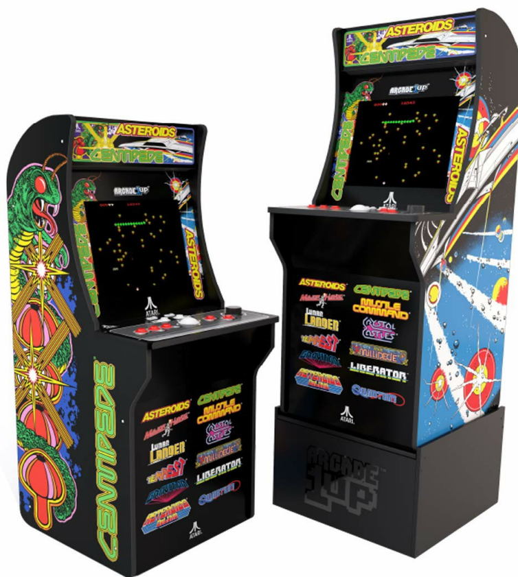
Image: The Arcade1Up cabinet shown both with and without its included riser, demonstrating the height difference for standing or seated play.