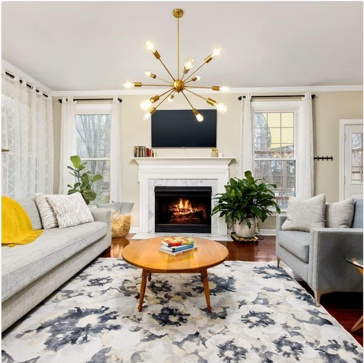
Image: The chandelier installed in a living room, demonstrating its aesthetic appeal and lighting coverage.