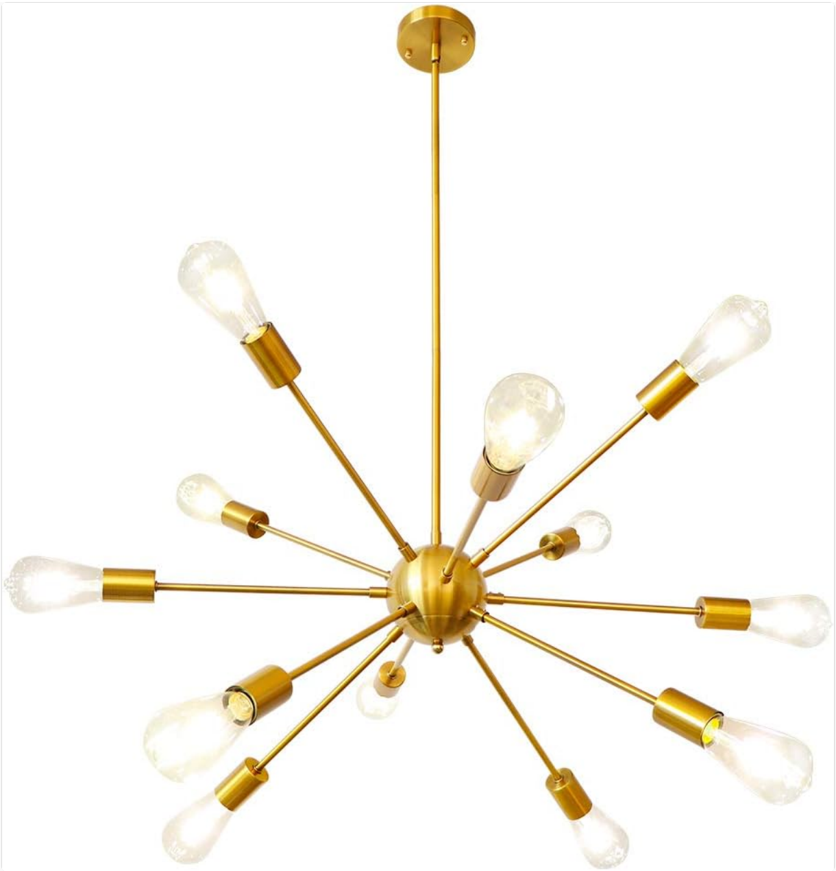
Image: The LynPon Gold Sputnik Chandelier with 12 lights, showcasing its modern design and gold finish.