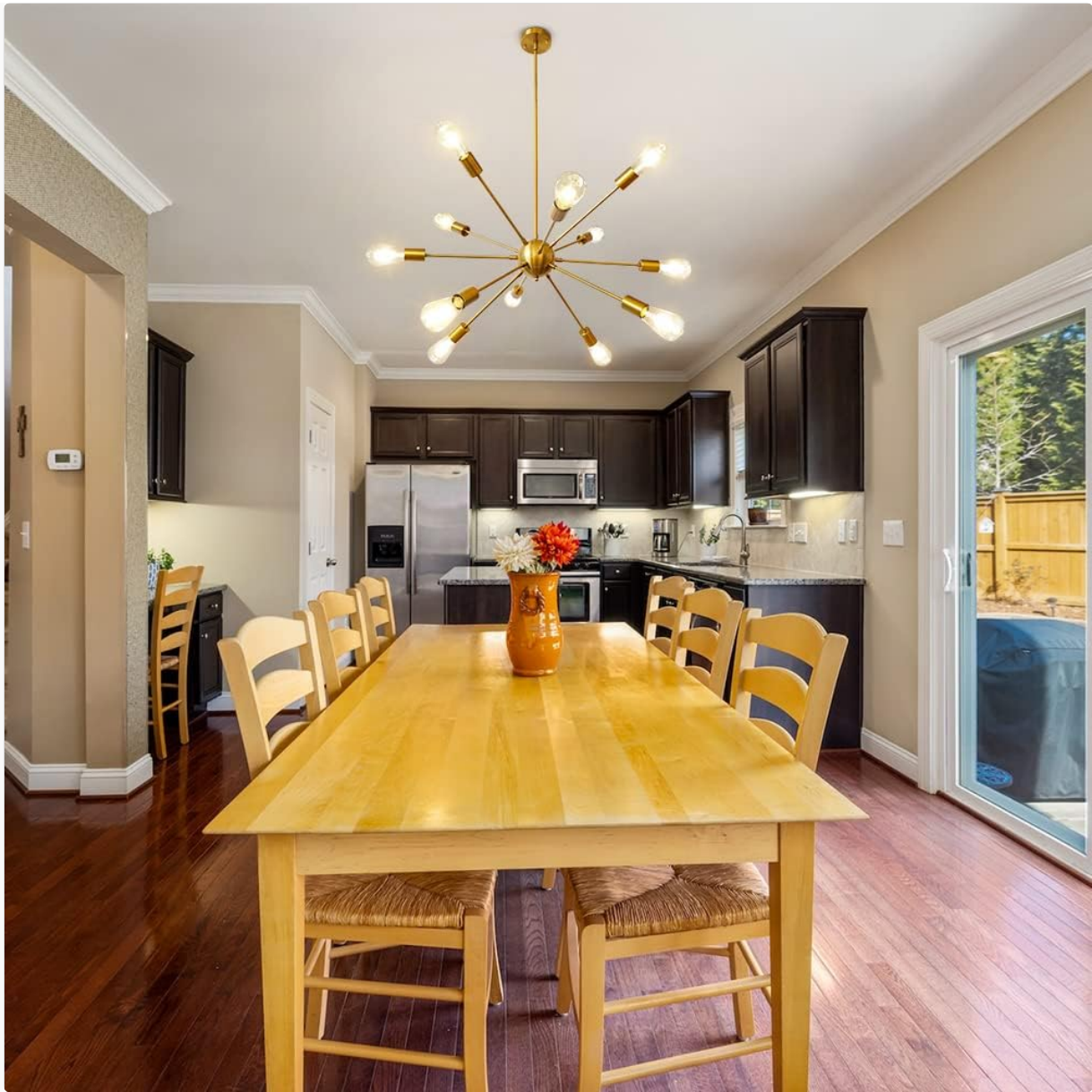
Image: Fully assembled LynPon Gold Sputnik Chandelier, showcasing its 12 arms extending from a central sphere.