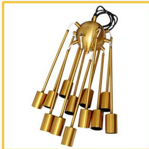
Image: Detailed view of an E26 bulb socket, indicating where to install the light bulbs.

Screw 12 E26 base bulbs (max 40W each, not included) into the sockets. The fixture supports LED, Edison, CFL, and incandescent bulbs. For dimming functionality, ensure you use dimmable bulbs and a compatible dimmer switch.