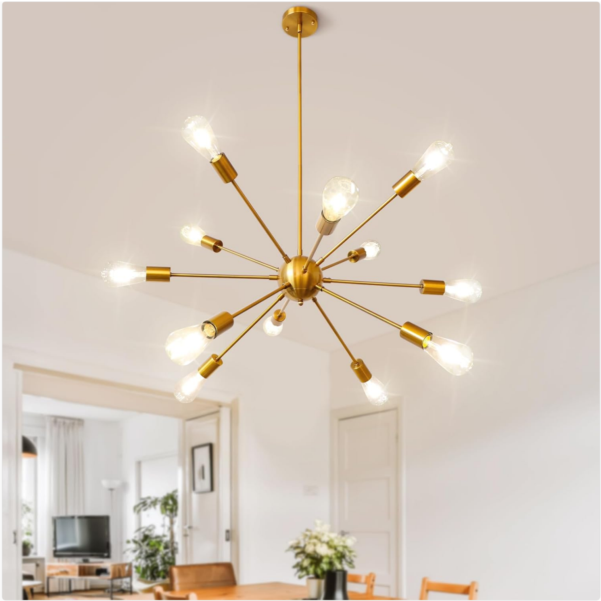
Image: The chandelier illuminating a dining room, highlighting its suitability for various interior spaces.