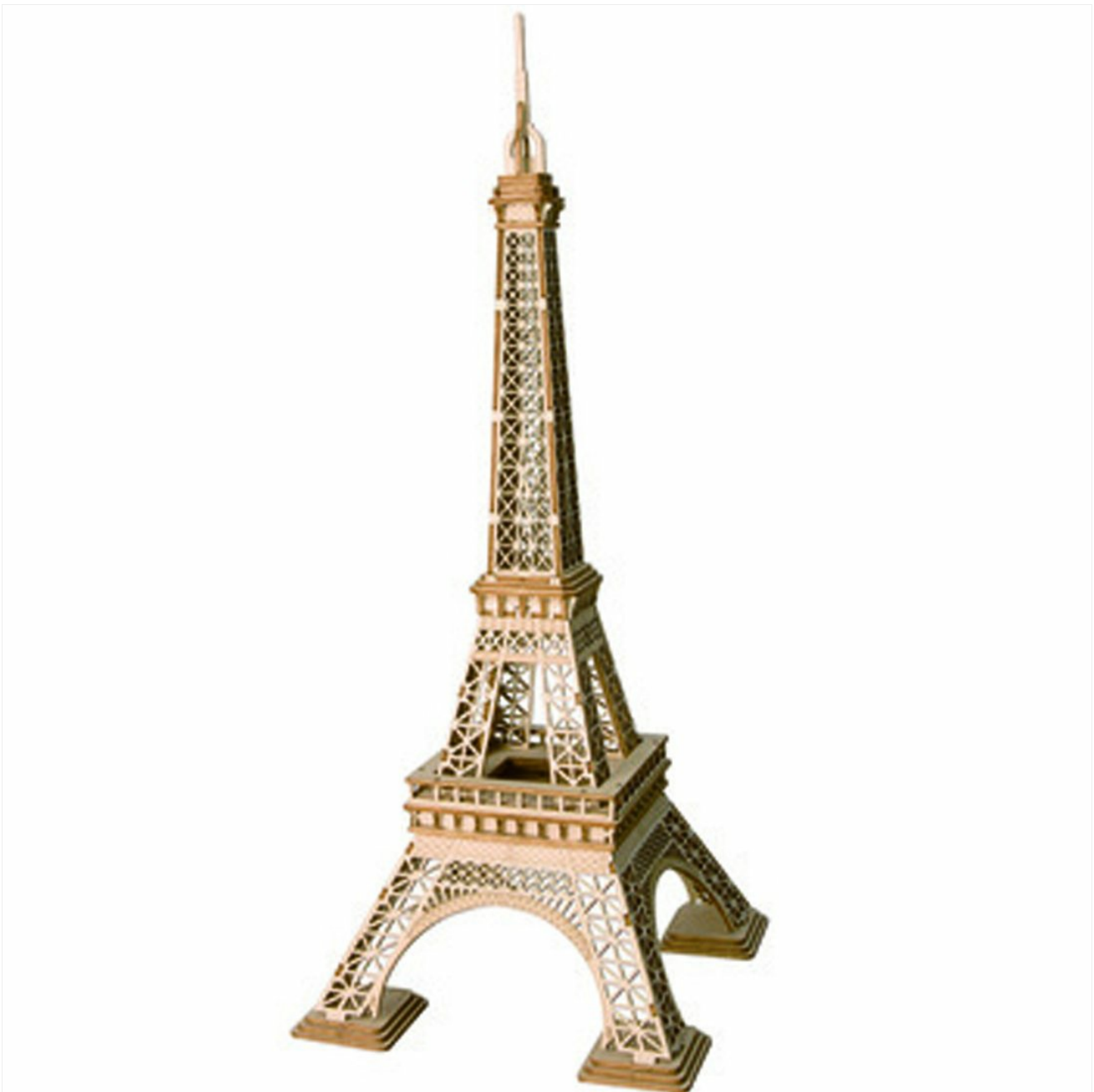
Image 1.1: The fully assembled Rolife Eiffel Tower 3D Wooden Puzzle.