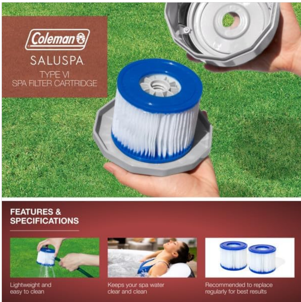
Image: Filter cartridge held in hand, ready for cleaning or replacement.