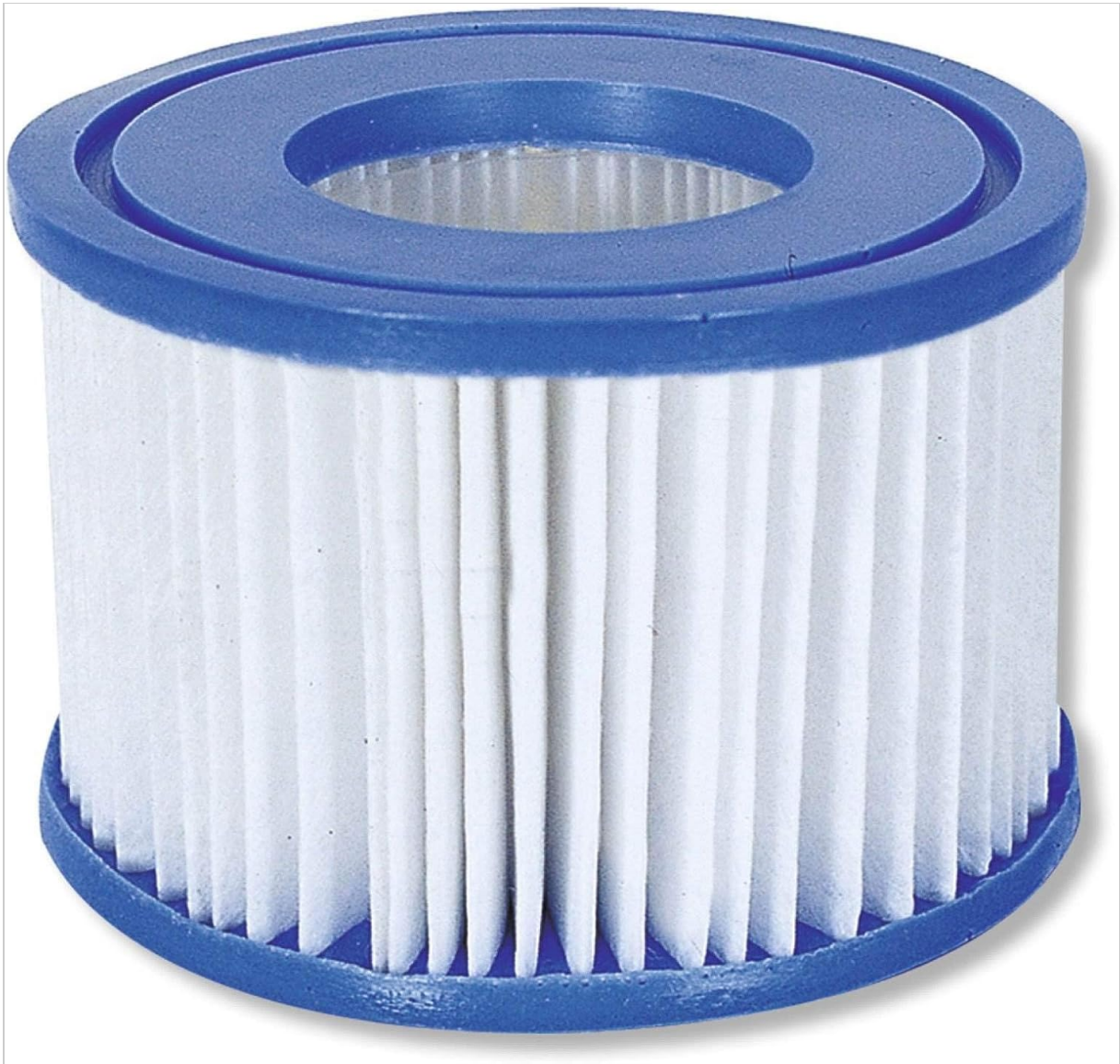
Image: Close-up of the filter cartridge's pleated design.