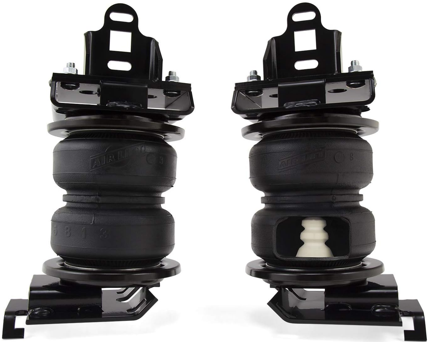
Image: Two Air Lift LoadLifter 5000 Ultimate Air Springs, showing the robust construction and integrated jounce bumper on one unit.