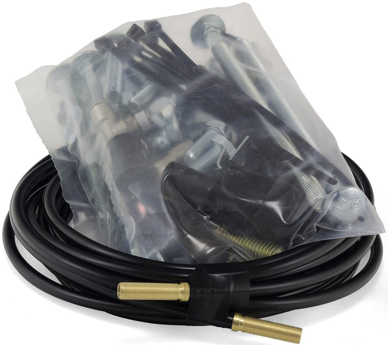
Image: Various mounting brackets included in the kit, essential for securing the air springs to the vehicle frame.