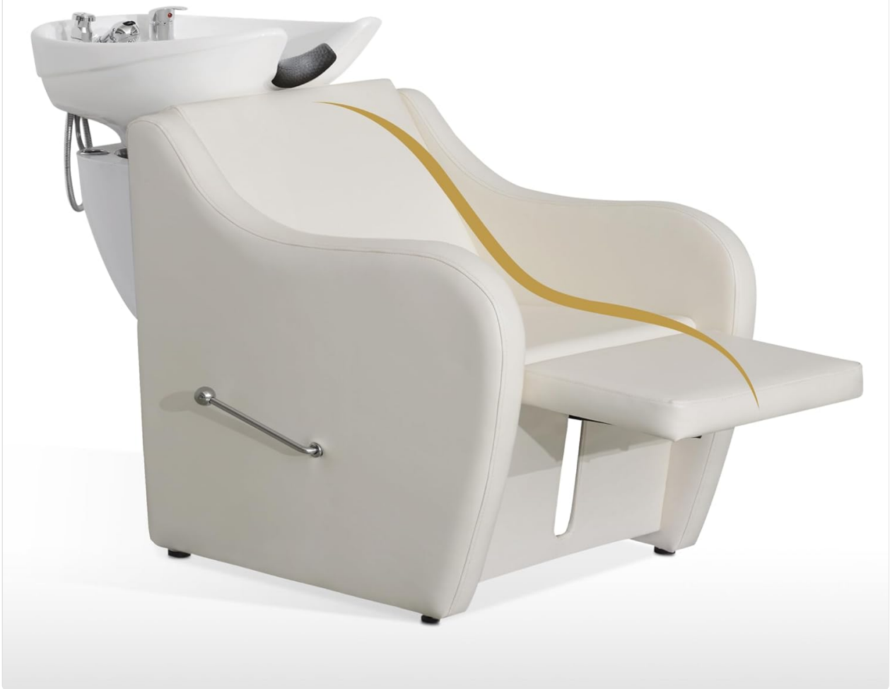
Figure 6: High-Quality Ceramic Basin. The basin is UPC certified, ensuring compliance with U.S. plumbing standards.