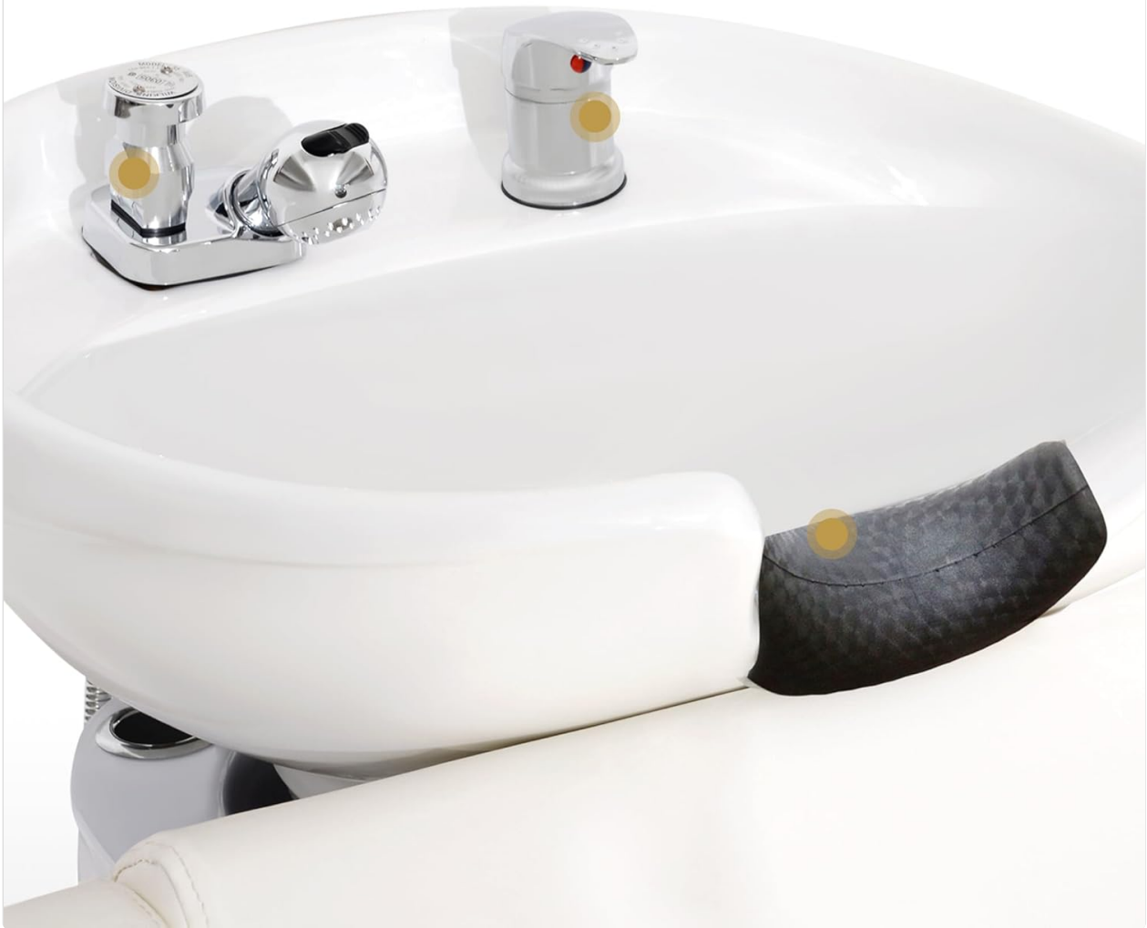
Figure 2: Adjustable Shampoo Basin Mechanism. The basin can be tilted to accommodate various client heights and preferences.