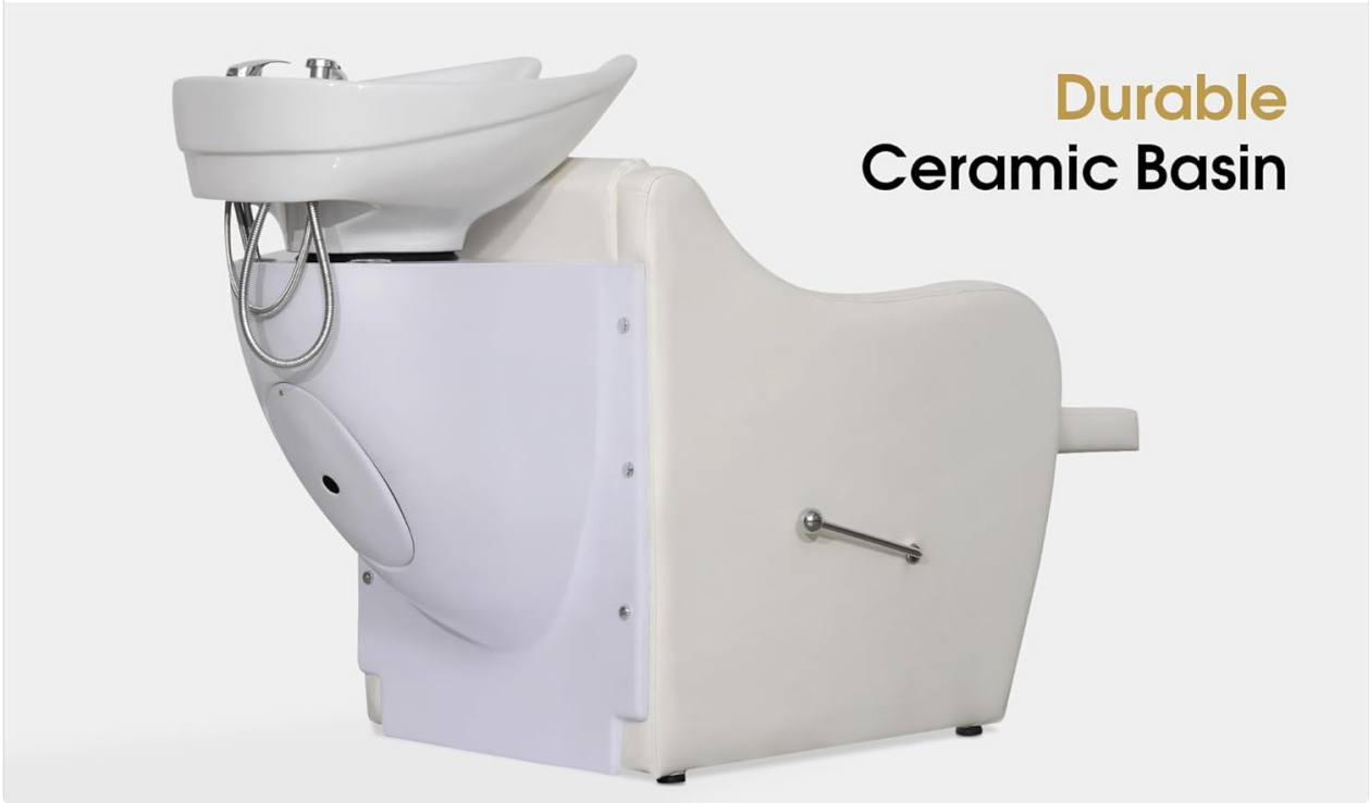
Figure 1: Product Dimensions and Components Overview.