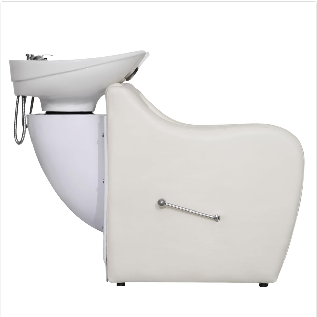
Figure 3: Leg Baffle Adjustment. The lever on the side of the chair allows for lifting or dropping the leg support for client comfort.