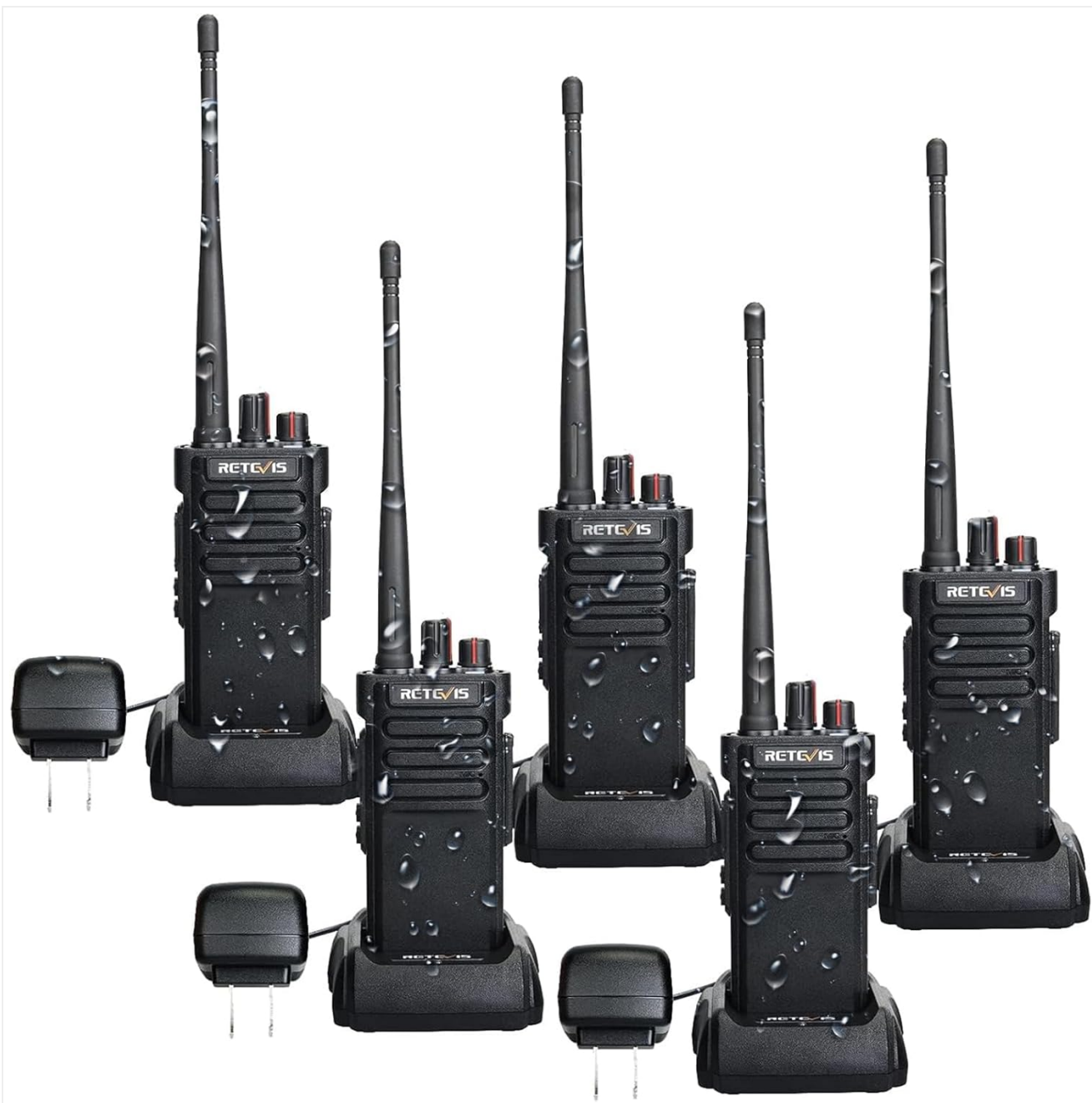
Figure 1: Retevis RT29 Two-Way Radios with Charging Docks. These radios are designed for heavy-duty use and feature IP67 water and dust resistance.