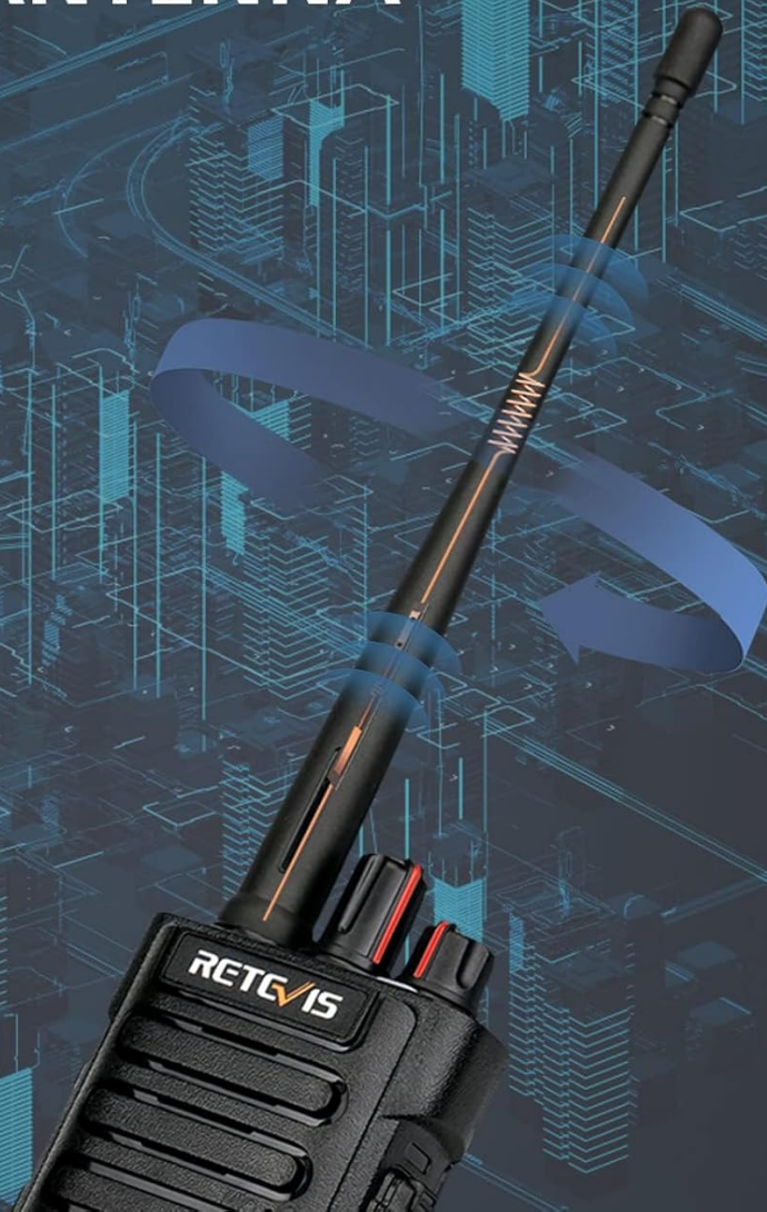
Figure 6: High Gain Antenna. The antenna is crucial for maximizing signal range and power.

can successive penetrate buildings; metal obstacles;