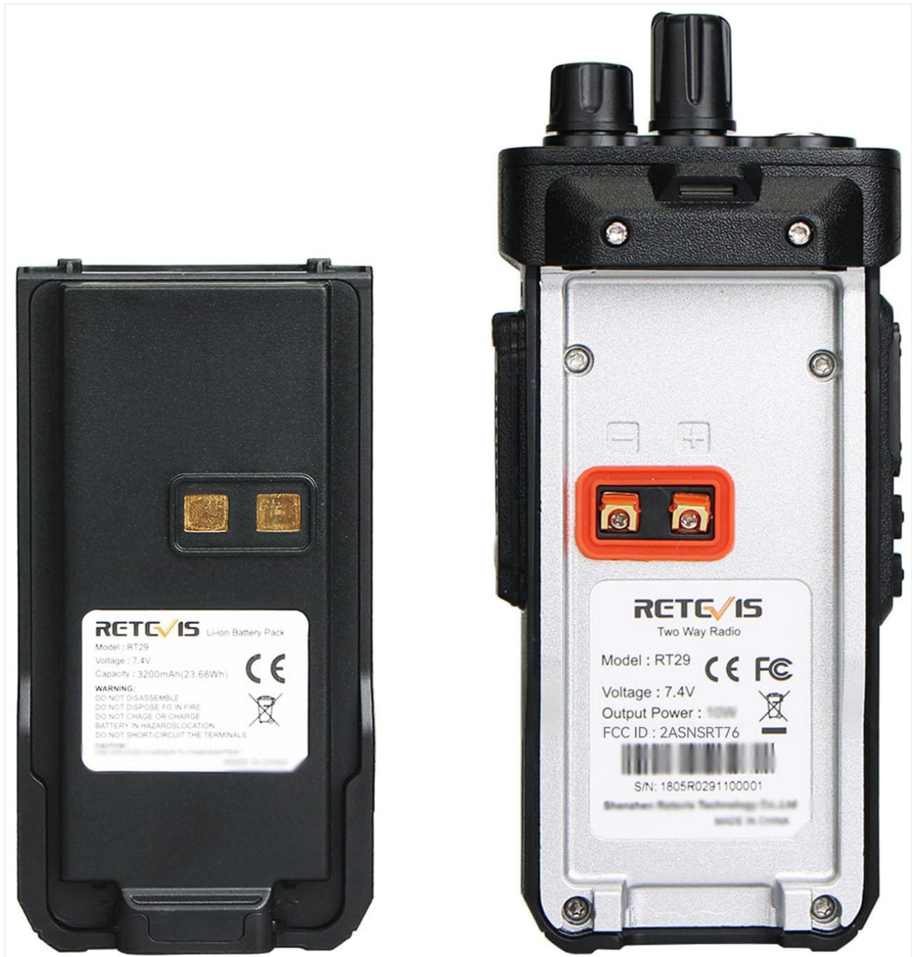
Figure 7: RT29 Radio Parts Diagram. Familiarize yourself with the radio's components.