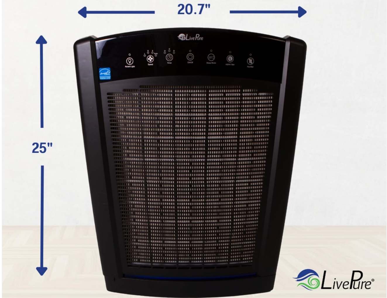
Figure 2: Dimensions of the LivePure Bali Series Air Purifier, showing a height of 25 inches and width of 20.7 inches.

Cleans the air in a 400 sq. ft. room 6.6 times per hour