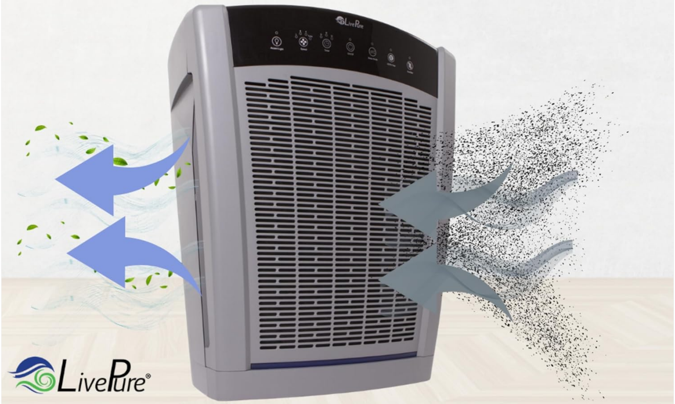
Figure 3: Illustration of the air purifier's effectiveness in capturing pet hair & dander, household dust, pollen, mold spores, smoke & odors, and bacteria.