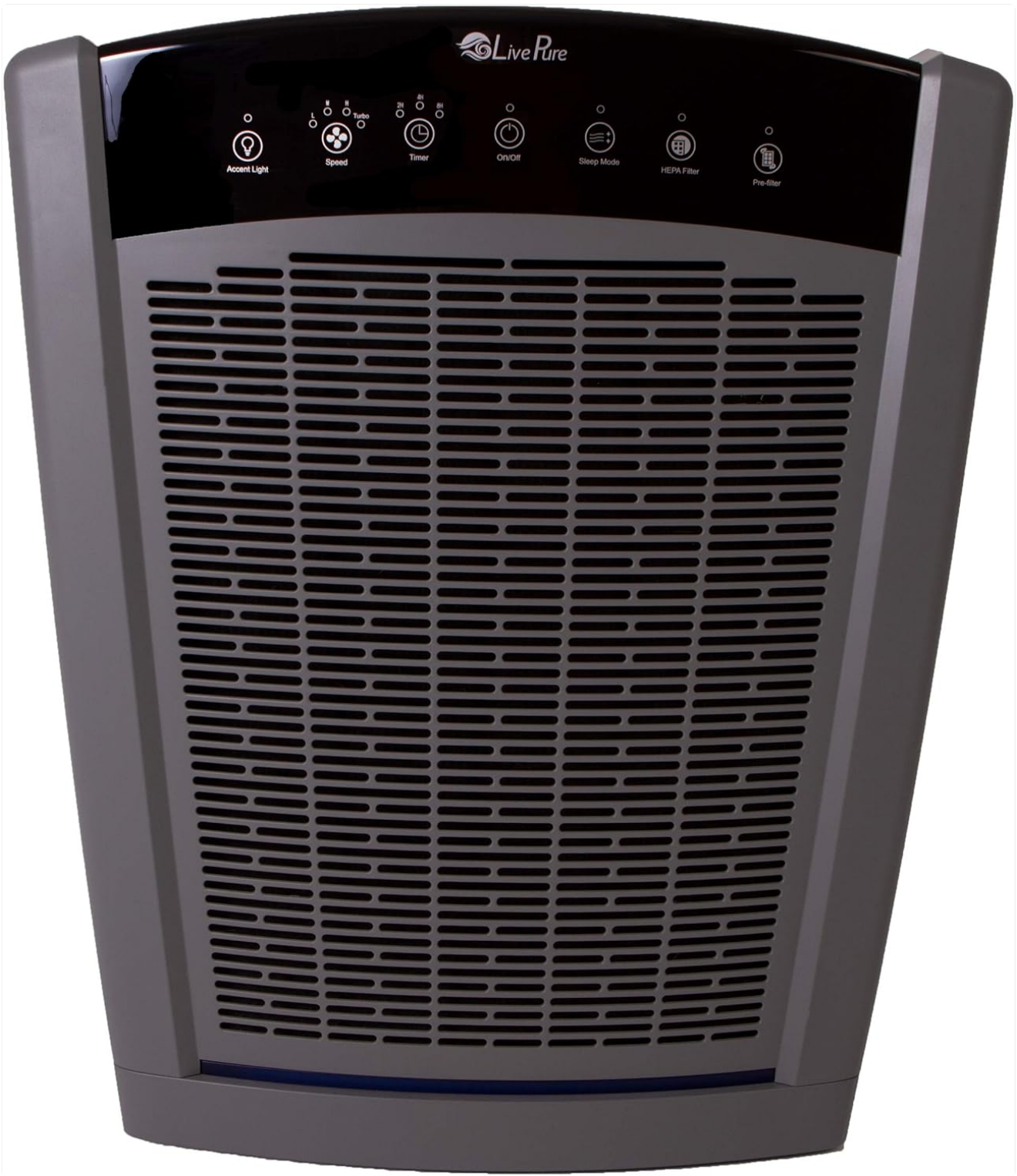
Figure 1: Front view of the LivePure Bali Series Air Purifier in Graphite color.