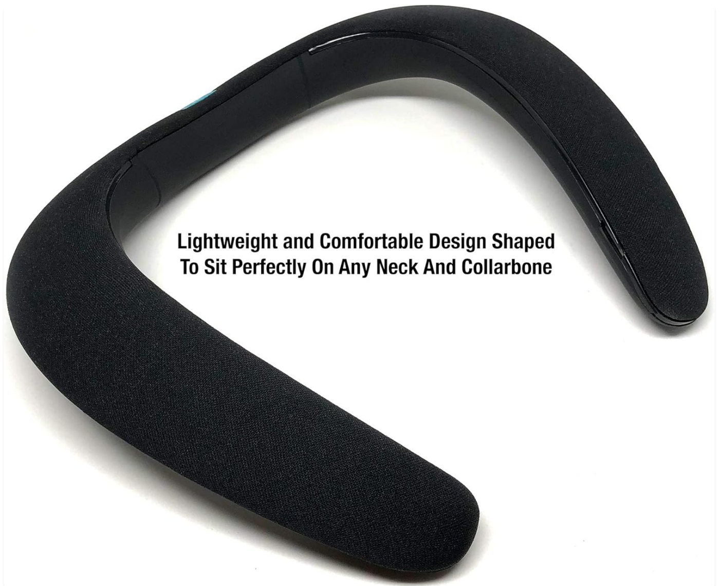
Figure 2: The speaker's lightweight and comfortable design, shaped to sit perfectly on the neck and collarbone.

The Long Run Technologies Neckband Speaker is designed for comfortable, immersive audio. Its ergonomic shape rests on your neck and collarbone, providing personal sound without isolating you from your surroundings.