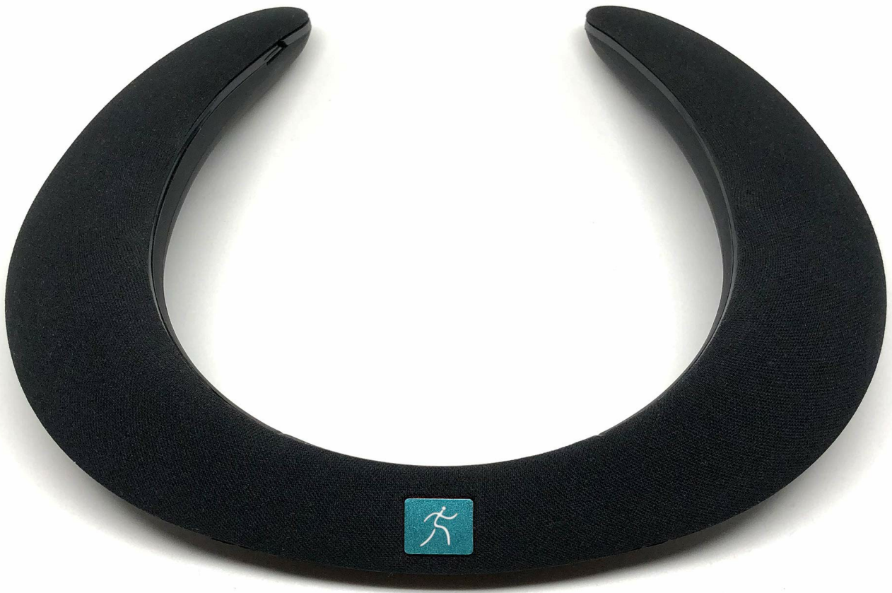
Figure 1: Long Run Technologies Neckband Wireless Wearable Bluetooth Speaker.