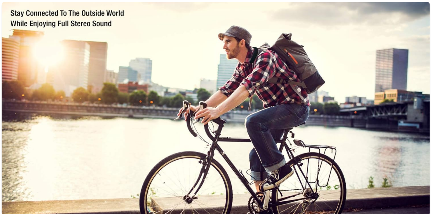
Figure 4: The neckband speaker is suitable for active use, such as during workouts, providing personal audio while allowing awareness of surroundings.

Stay Connected To The Outside World While Enjoying Full Stereo Sound