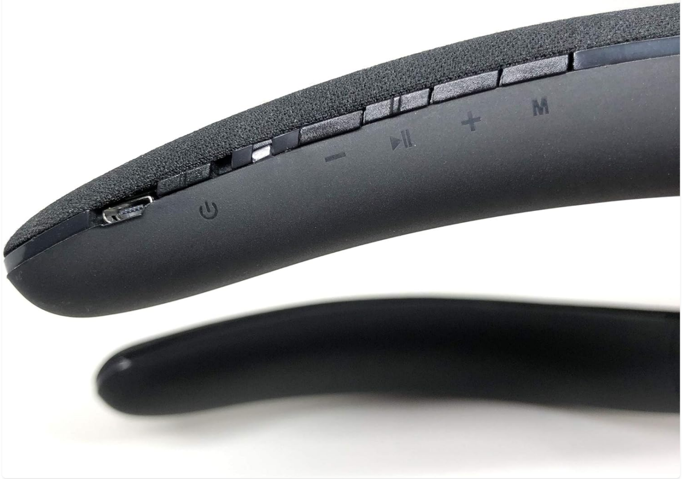
Figure 3: Close-up view of the control buttons and ports on the neckband speaker, including power, volume, play/pause, mode, and charging port.