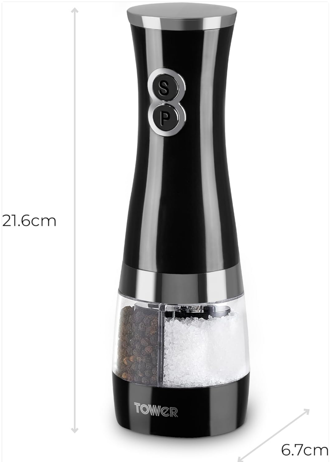
Figure 3: Product dimensions for placement and storage.