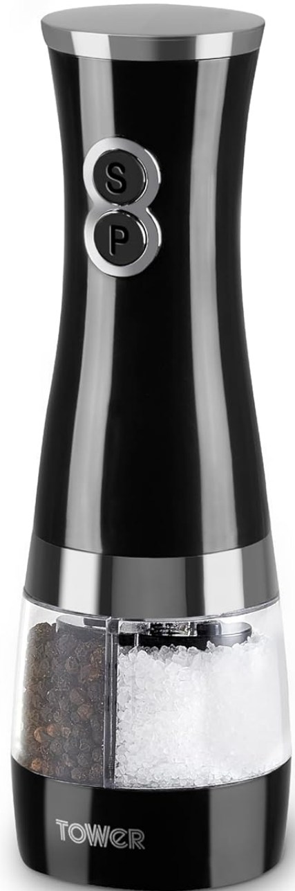
Figure 2: Key features including 2-in-1 design, stylish accents, battery operation, individual buttons, and adjustable ceramic grinders.