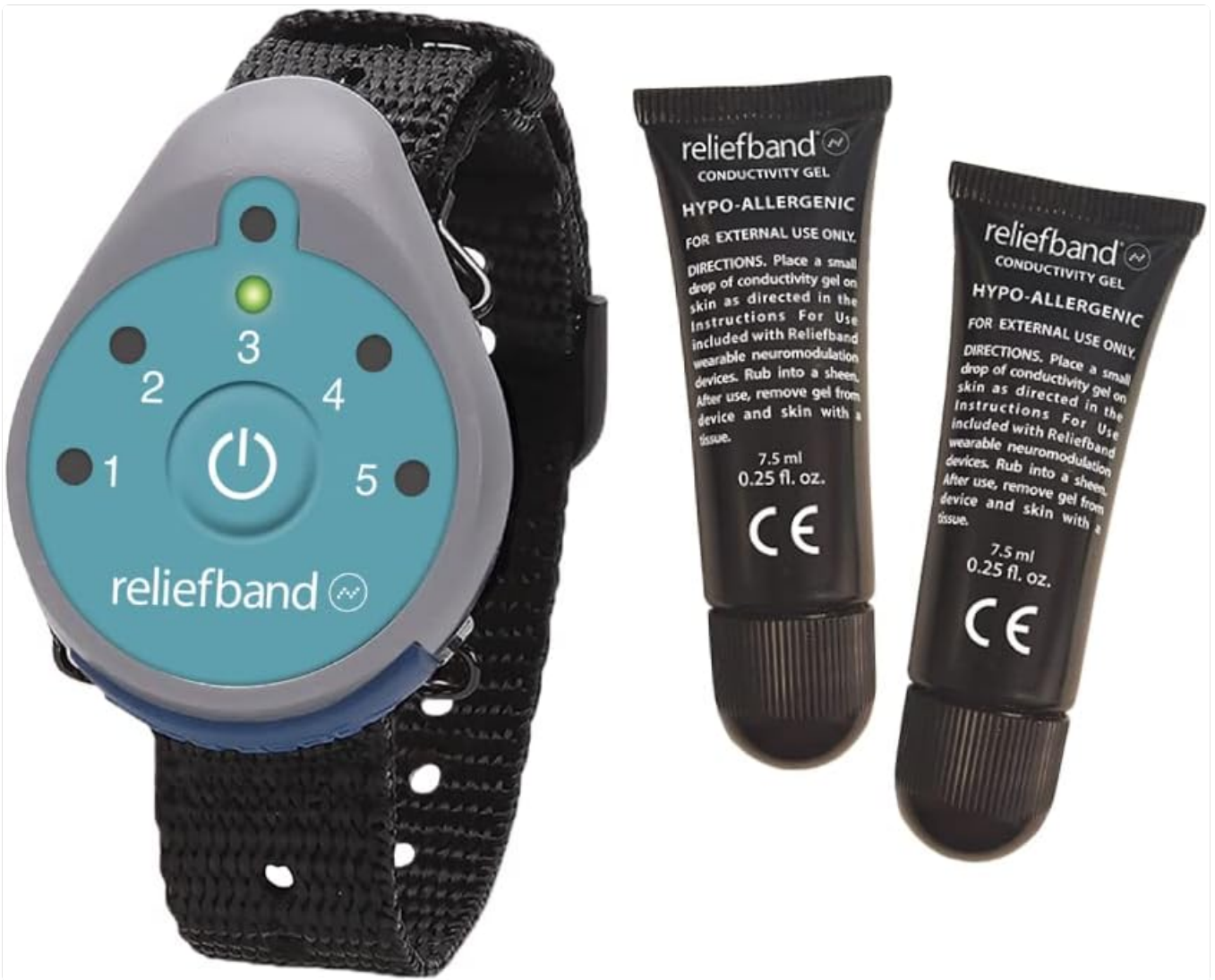
Image: The Reliefband Classic Wristband shown with two tubes of hypoallergenic conductivity gel.