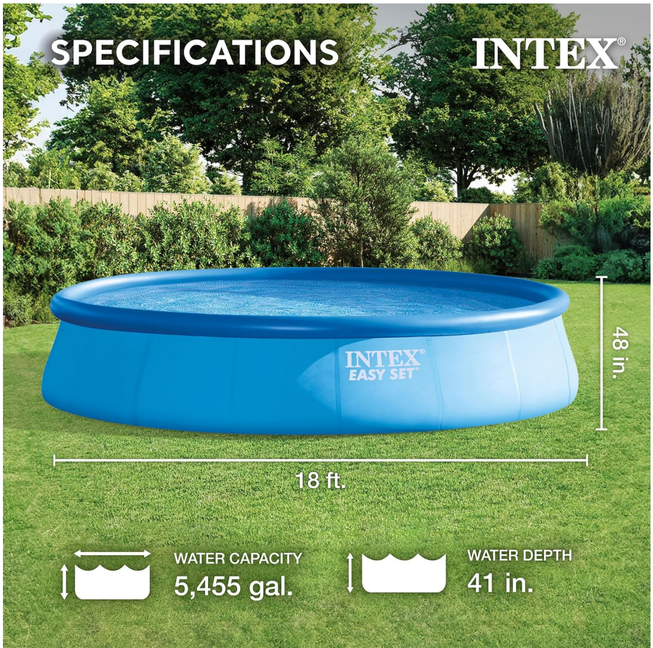
Image: Visual representation of pool specifications including 18 ft diameter, 48 in height, 5,455 gal water capacity, and 41 in water depth.