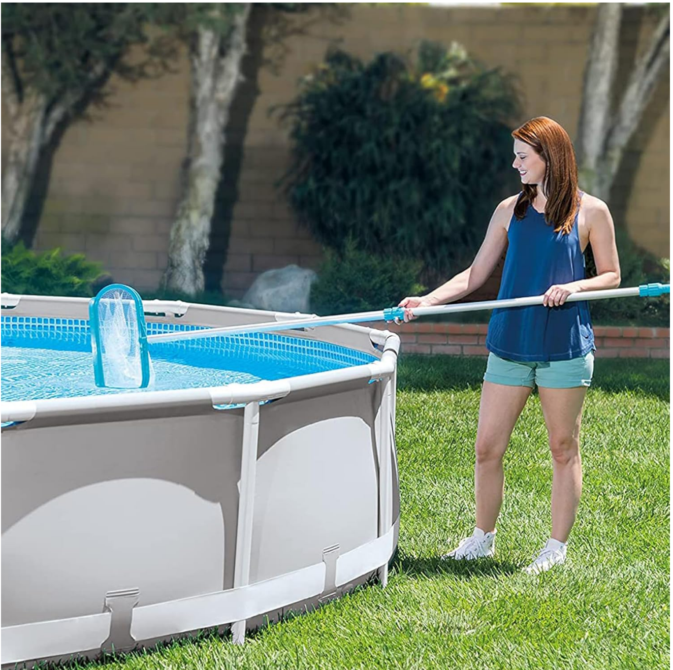
Image: A person demonstrating the use of the pool maintenance kit to clean an above-ground pool.