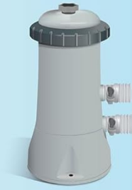
Krystal Clear™ Cartridge Filter Pump