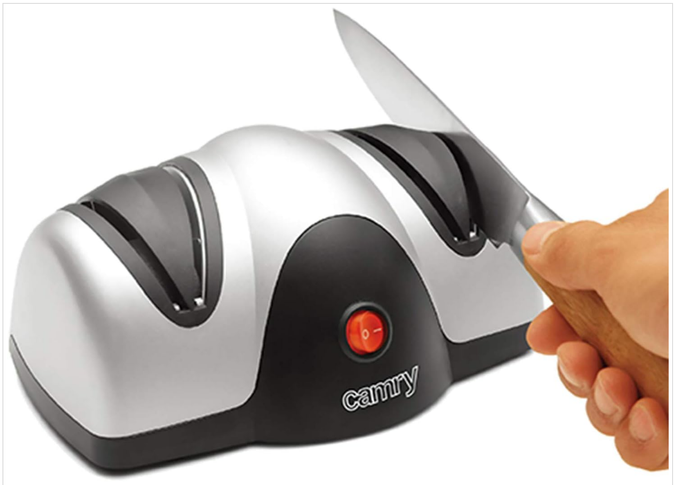
Figure 1: Front view of the CAMRY Electric Knife Sharpener CR 4469 with a knife inserted into a sharpening slot. This image illustrates the general appearance and how a knife is positioned for sharpening.