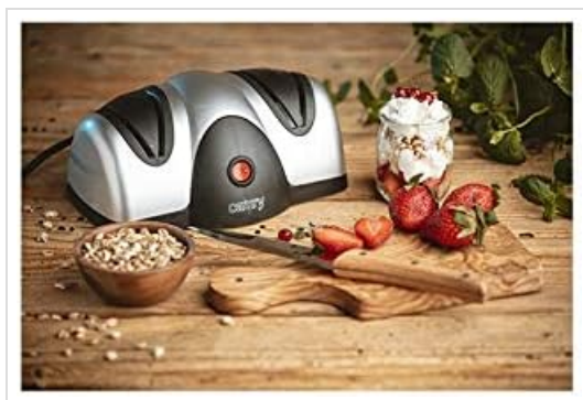
Figure 3: The CAMRY Electric Knife Sharpener positioned on a wooden surface in a kitchen environment, alongside fresh produce. This image demonstrates the product's intended use setting.

After sharpening, carefully wipe the blade with a damp cloth to remove any metal particles. Always test the sharpness on a piece of paper or a tomato, not on your finger.