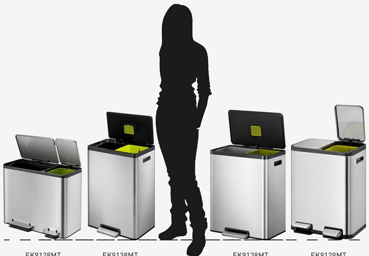
EK9128MT 15L+30L 60.5x32.1x49.2cm 23.8"x19.4"x10.6"/29" lid open height