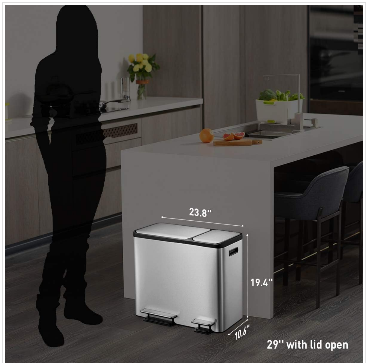
Image: Product dimensions including width, height, and depth.