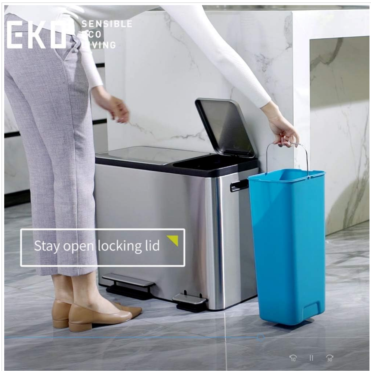
Image: Demonstrating the removal of an inner liner bucket for easy emptying or bag change.