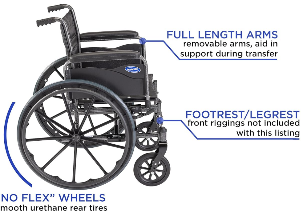
Image Description: A side view of the Invacare Tracer EX2 wheelchair. Key features such as the full-length removable arms and the "no flex" urethane rear wheels are highlighted. A textual note clarifies that footrests/legrests are not included with this specific listing.