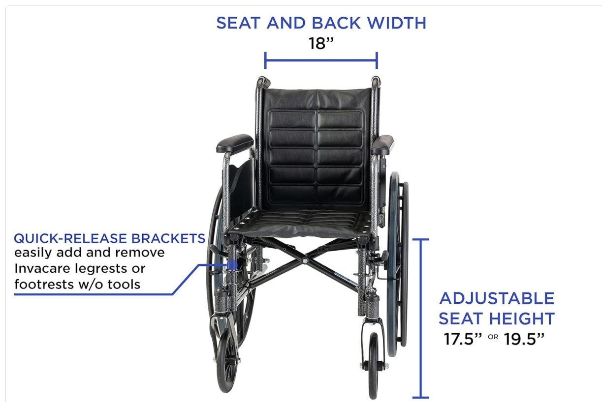
Image Description: A front view of the Invacare Tracer EX2 wheelchair. Labels indicate a seat and back width of 18 inches and an adjustable seat height of 17.5 or 19.5 inches. Quick-release brackets for legrests or footrests are also highlighted.