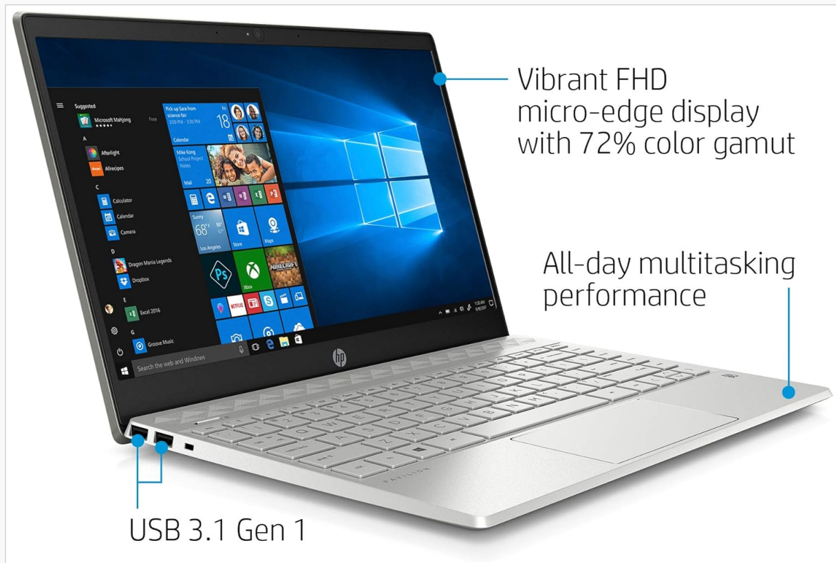
Image: Left side of the laptop, highlighting the USB 3.1 Gen 1 port and the vibrant FHD micro-edge display.