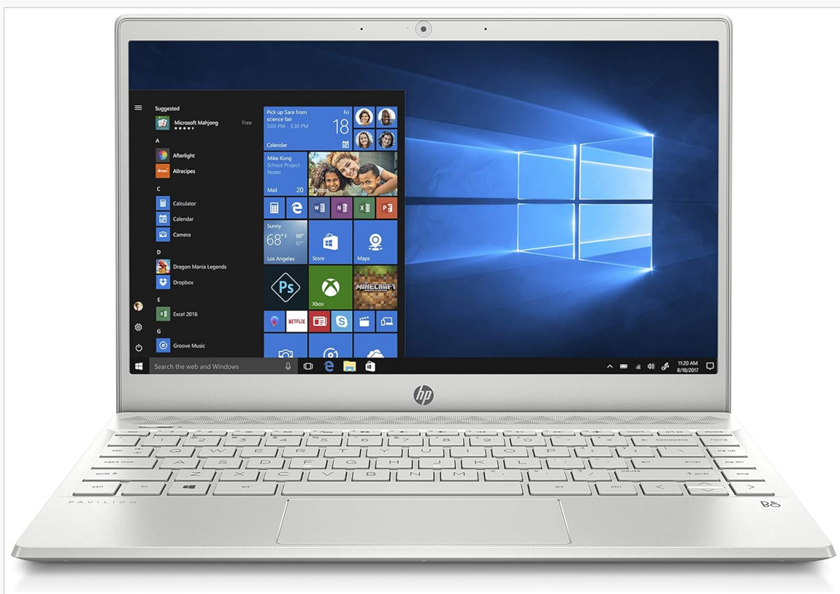
Image: Front view of the HP Pavilion 13-inch Laptop, showcasing the display and keyboard.

This manual provides essential information for setting up, operating, maintaining, and troubleshooting your HP Pavilion 13-inch Light and Thin Laptop, model 13-an0010nr. Please read this guide thoroughly to ensure proper use and longevity of your device.