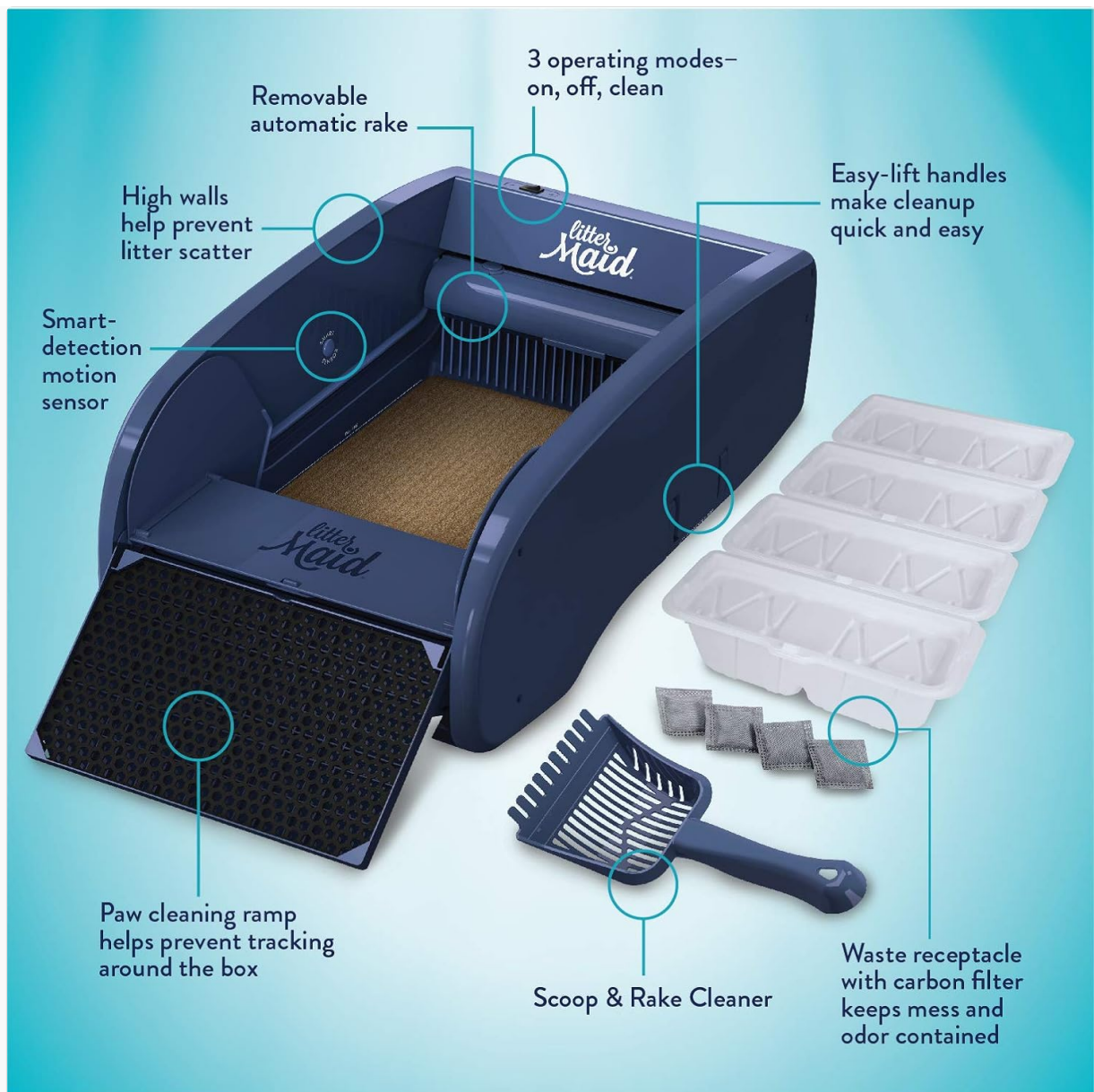
Image: The LitterMaid unit highlighting its key features: removable automatic rake, high walls, smart-detection motion sensor, paw cleaning ramp, scoop & rake cleaner, and waste receptacle with carbon filter.