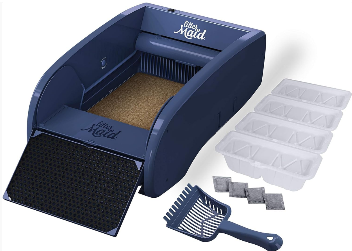
Image: The LitterMaid Multi-Cat Self-Cleaning Litter Box shown with its main unit, four waste receptacles, four carbon filters, a scoop and rake cleaner, and a paw cleaning ramp.