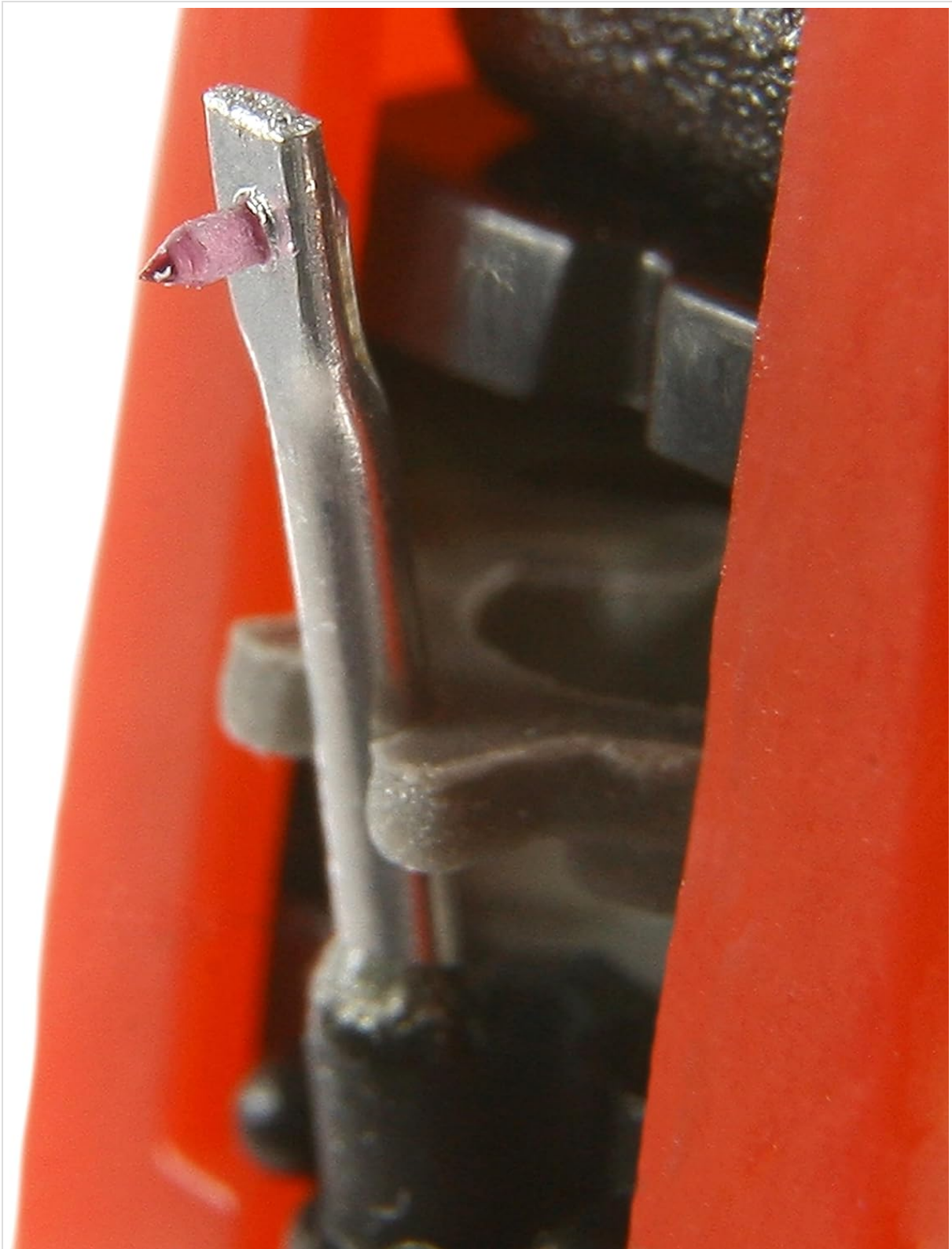
Image 2: A close-up view of the CAMRY stylus (needle) tip. This image highlights the delicate cantilever and the small, conical or elliptical diamond tip responsible for tracking the record grooves. Handle with extreme care.