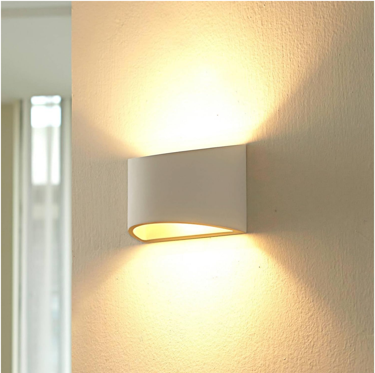
Image 1.1: The Lindby Heiko wall lamp in operation, showcasing its dual light emission.