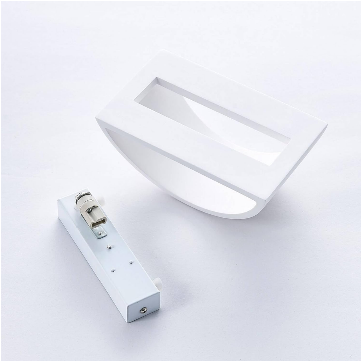
Image 2.1: Components of the Lindby Heiko wall lamp, including the plaster body and mounting bracket.