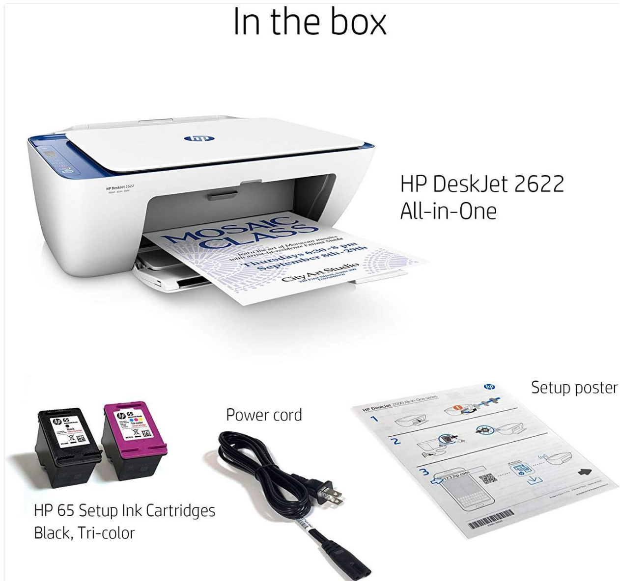
Diagram summarizing main features and additional features of the HP DeskJet 2622.