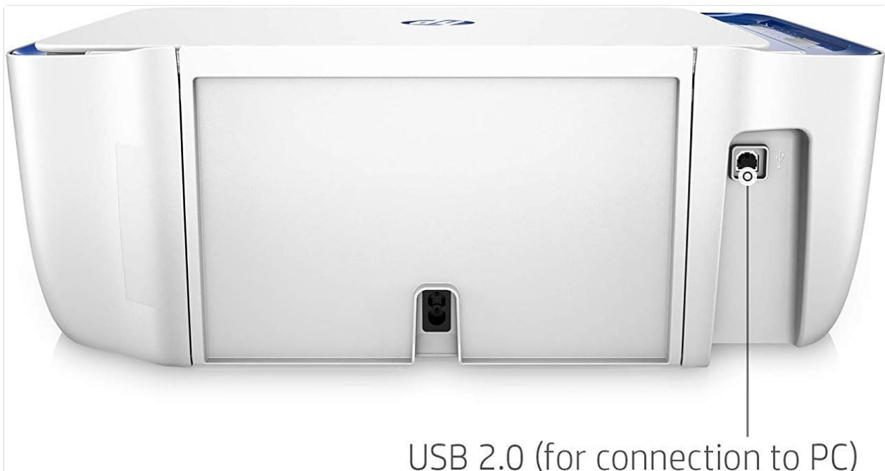
Rear view of the printer, indicating the USB 2.0 port for PC connection.