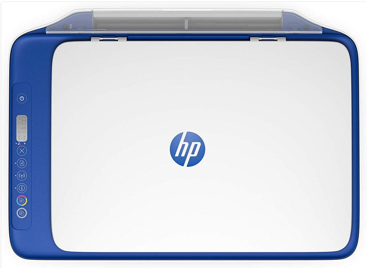
Top-down view of the HP DeskJet 2622 printer, showing the HP logo and control panel.