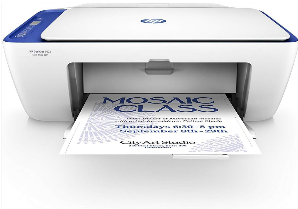
Front view of the HP DeskJet 2622 printer with a document printing.

This manual provides essential information for setting up, operating, maintaining, and troubleshooting your HP DeskJet 2622 All-in-One Compact Printer. This device is designed for printing, scanning, and copying documents and images.