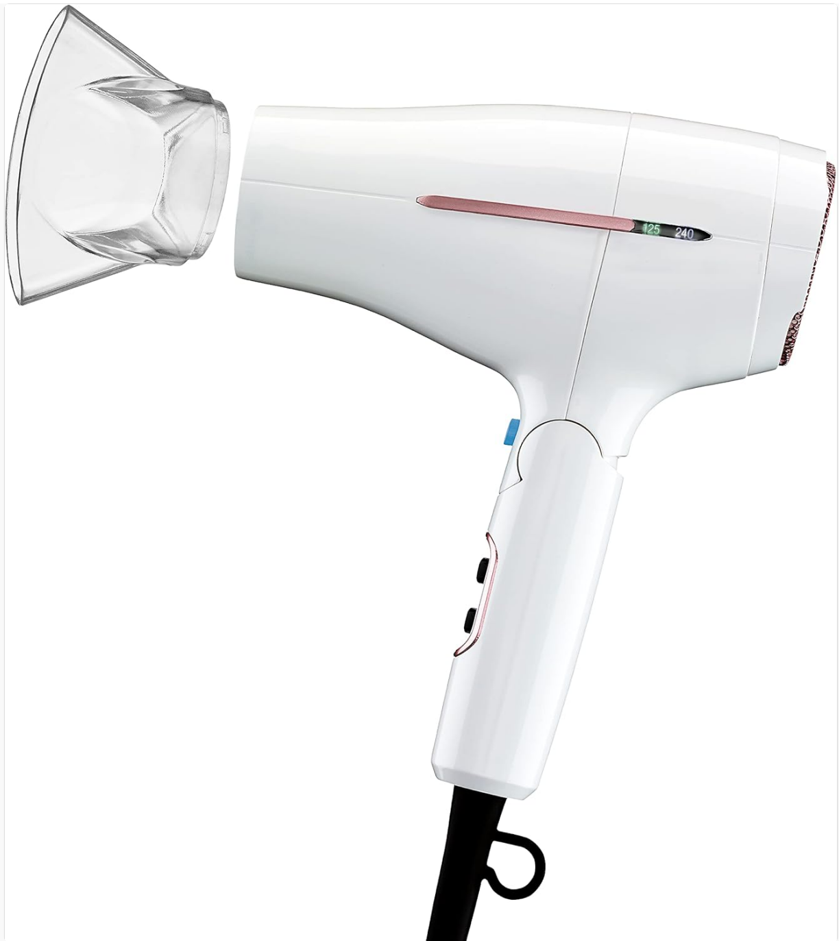
Figure 1: Conair Double Ceramic Travel Dryer with concentrator attached.