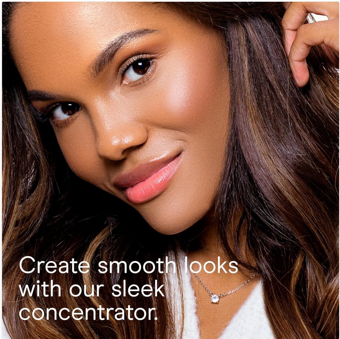
Figure 3: The concentrator attachment for focused airflow and smooth styles.