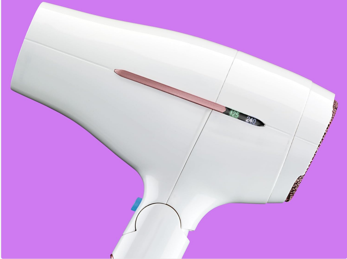
Figure 5: Smart Voltage Technology adapts globally with full power.

Smart Voltage adapts globally with full power.