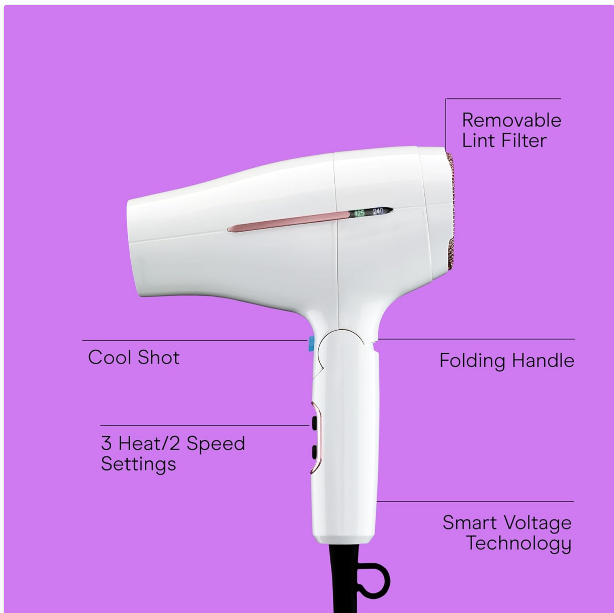
Figure 4: Key features and controls of the Conair Double Ceramic Travel Dryer.