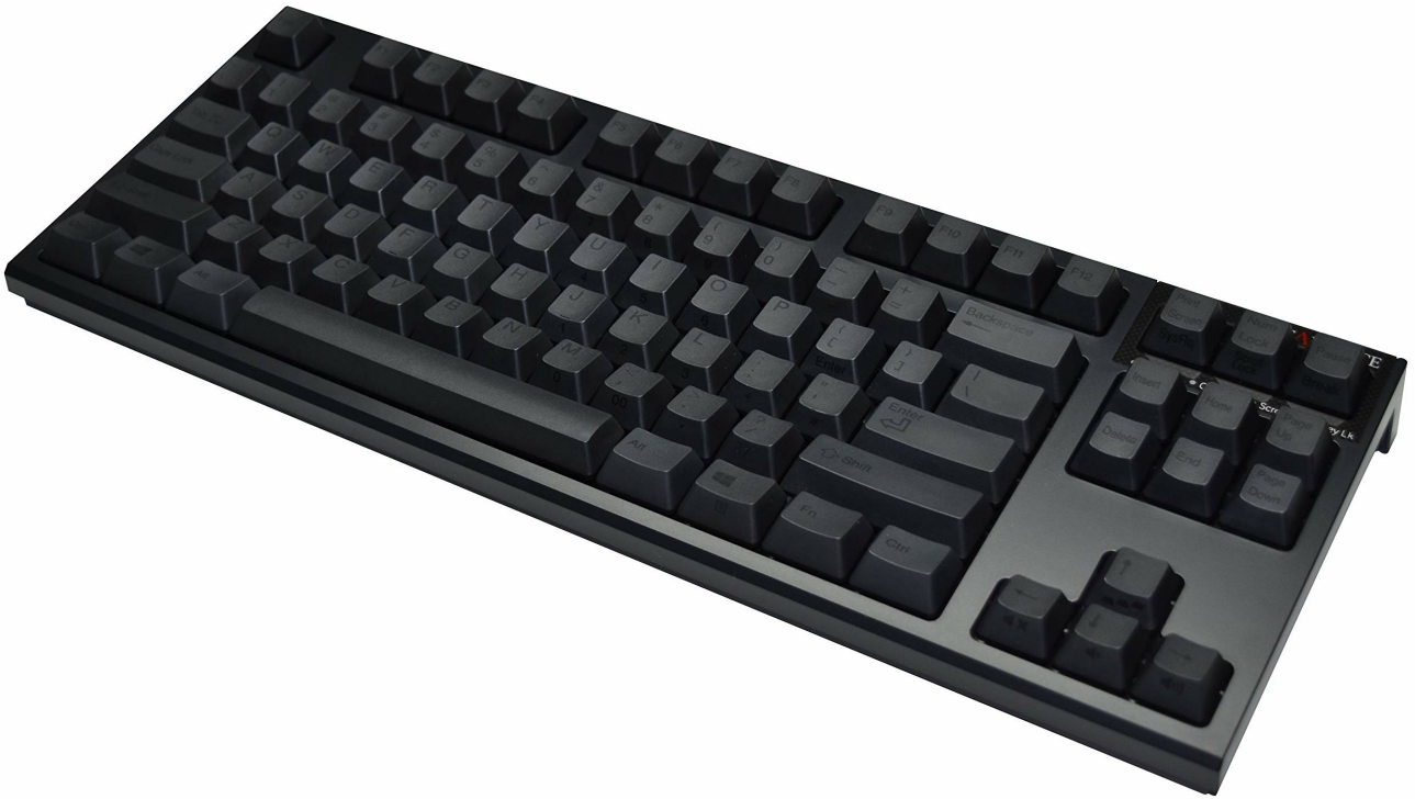
Figure 1: Realforce R2 PFU Limited Edition Keyboard. This image shows the full layout of the keyboard, highlighting its compact tenkeyless design and matte black finish.