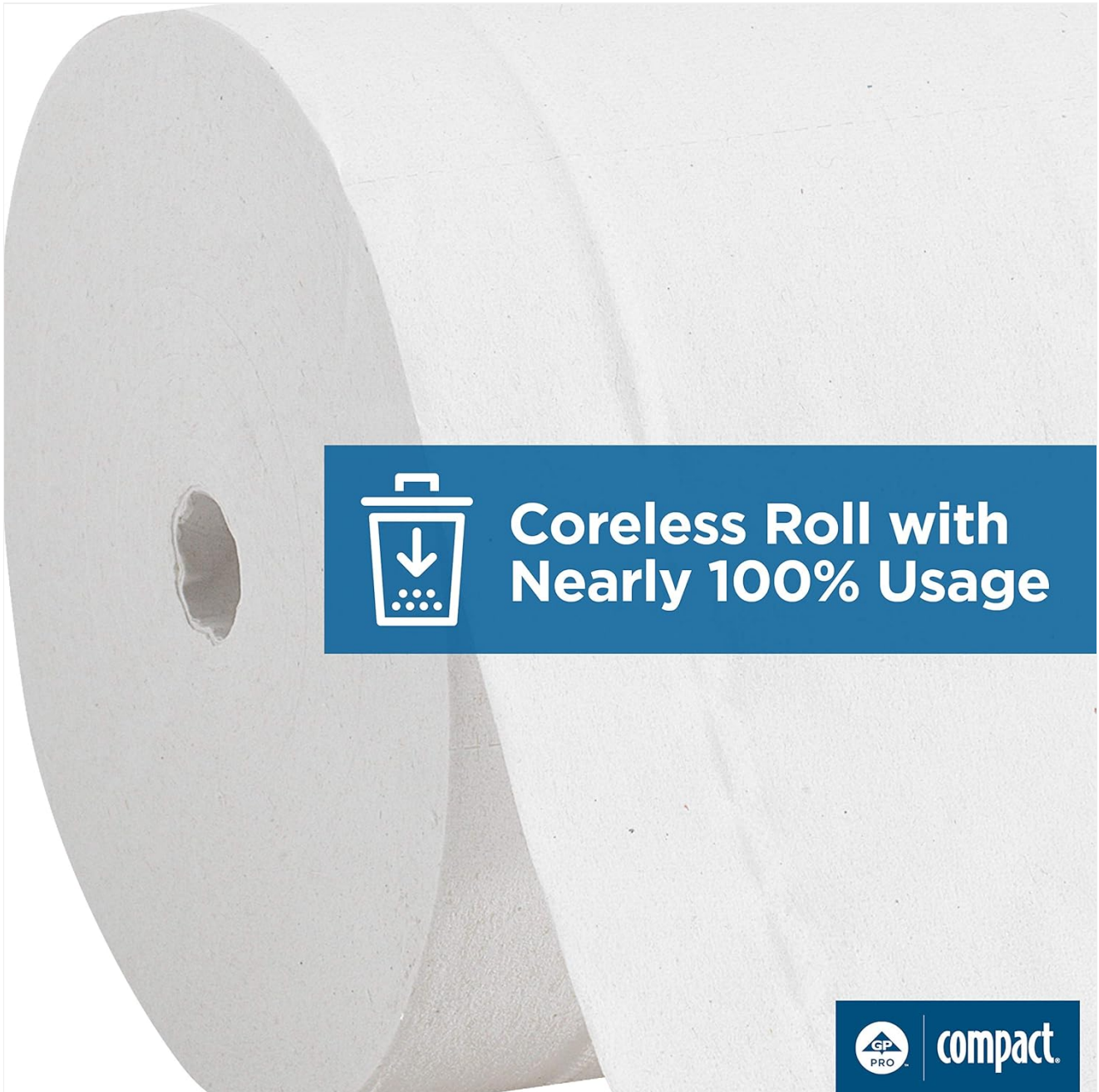
Image: A coreless toilet paper roll, demonstrating its design for nearly 100% usage and reduced waste.