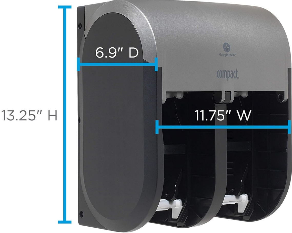
Image: Detailed dimensions of the dispenser (Height: 13.25", Width: 11.75", Depth: 6.9").