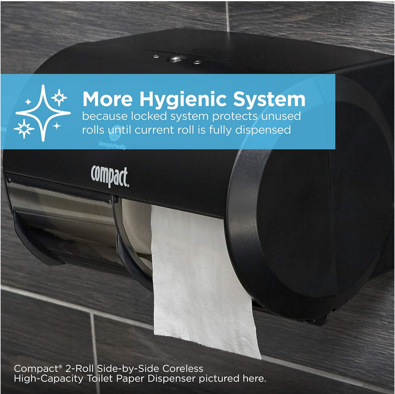
Compact® 2-Roll Side-by-Side Coreless High-Capacity Toilet Paper Dispenser pictured here.