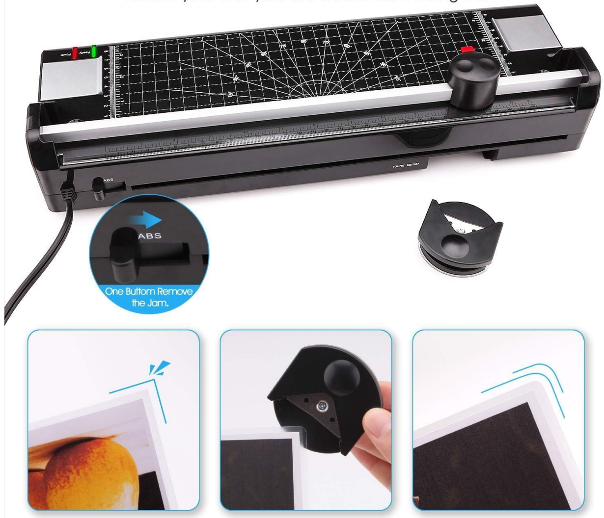
Image: The laminator indicating its quick preheat time and efficient laminating speed.

Protect your and your child's skin from being cut