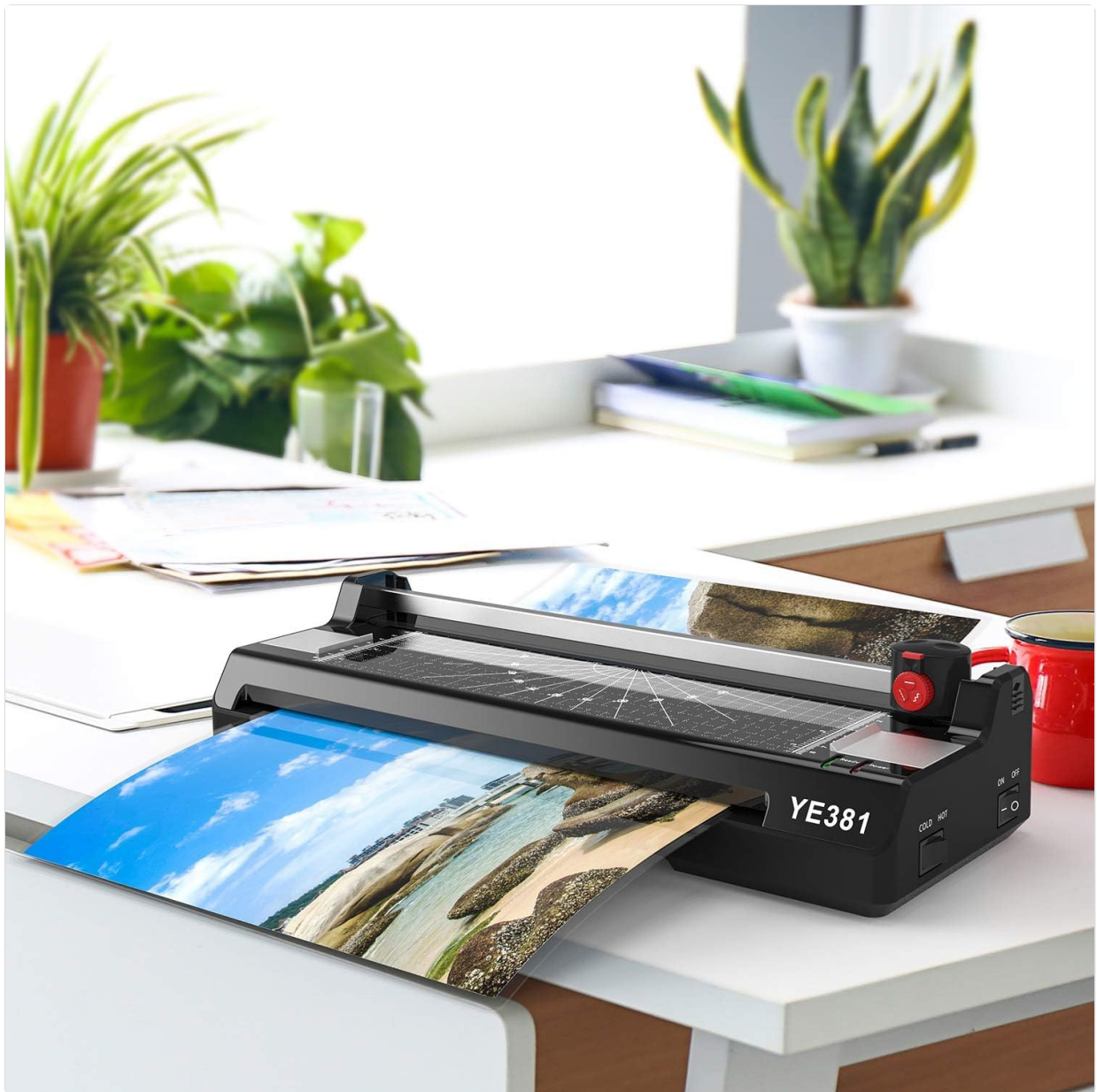
Image: Step-by-step visual guide for the laminating process.

Video: A demonstration of the laminating process, including the use of the trimmer and ABS button.