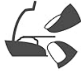
Image: The front-facing door allows for easy removal of a single battery.