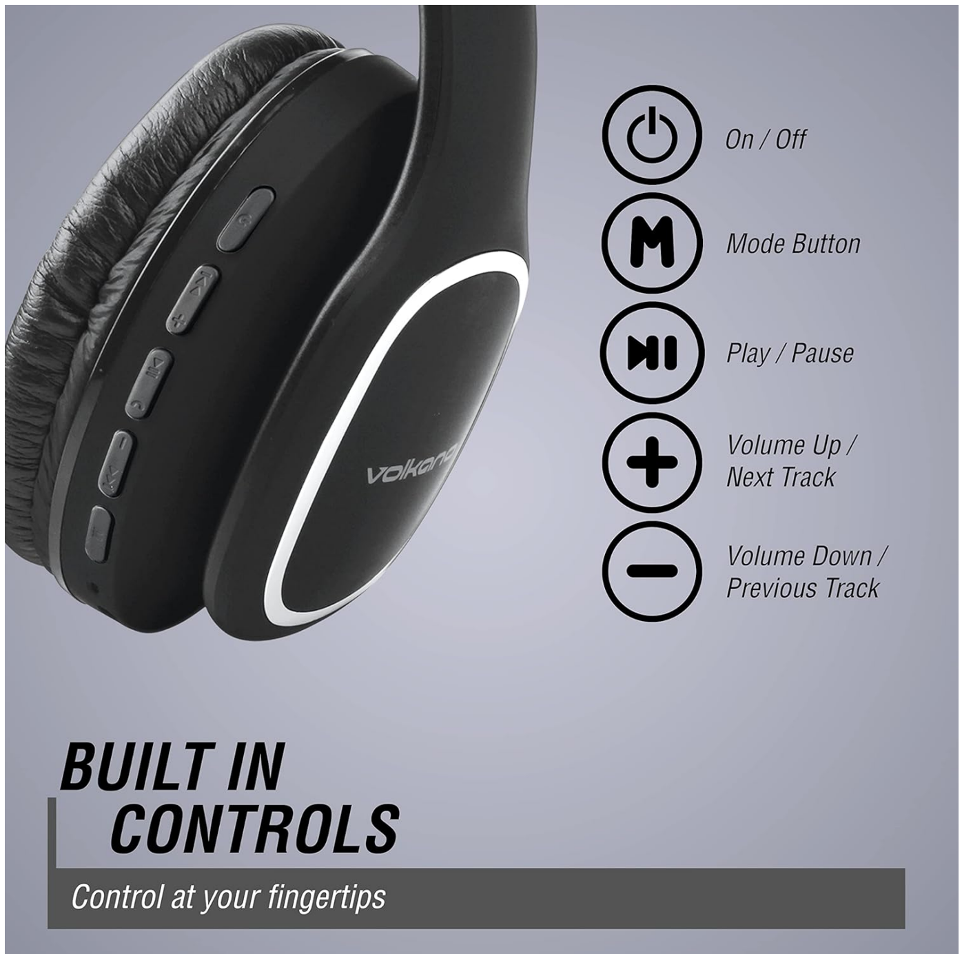
Image: Close-up of the right earcup showing the control buttons: On/Off, Mode Button, Play/Pause, Volume Up/Next Track, and Volume Down/Previous Track.