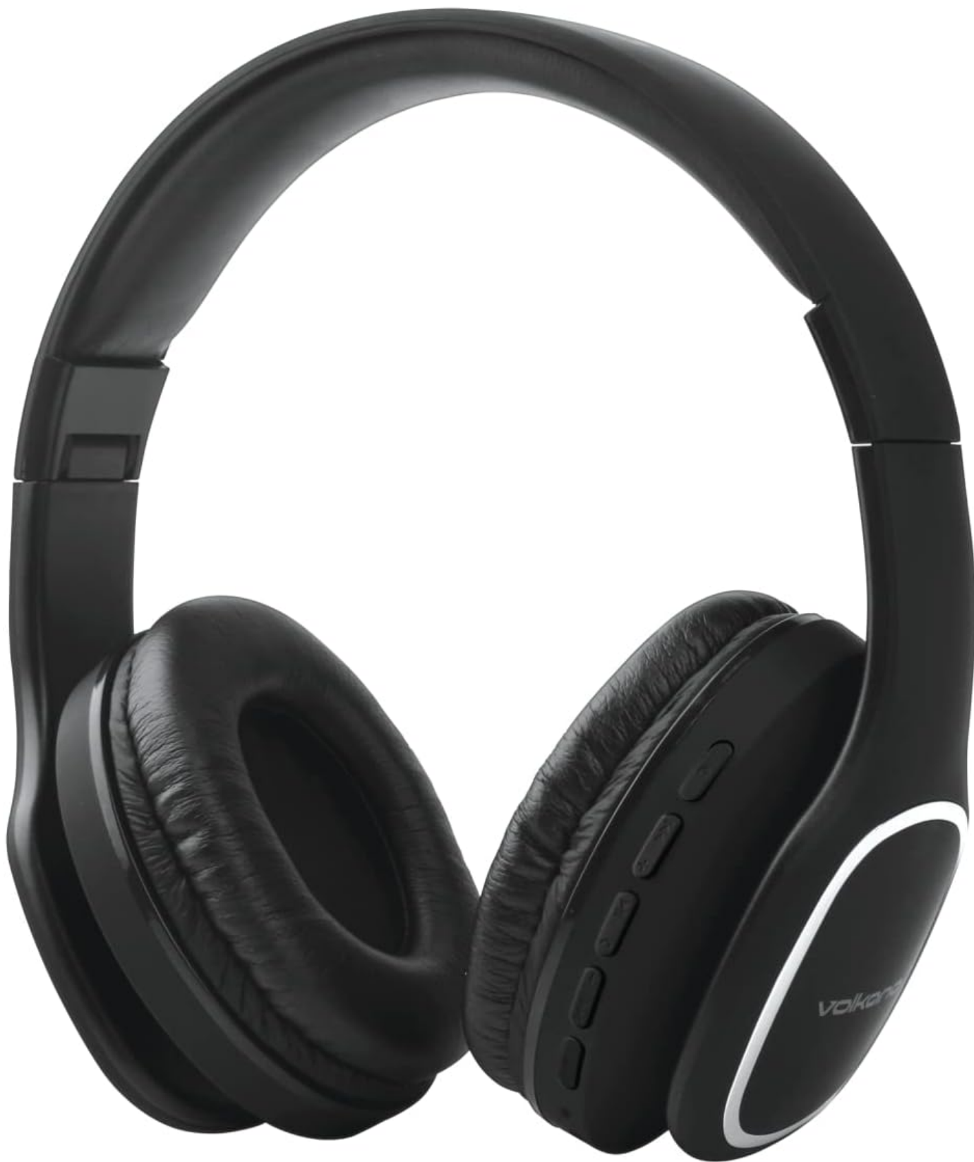
Image: Volkano Phonic Series Wireless Headphones, black, showing the over-ear design and controls on the right earcup.