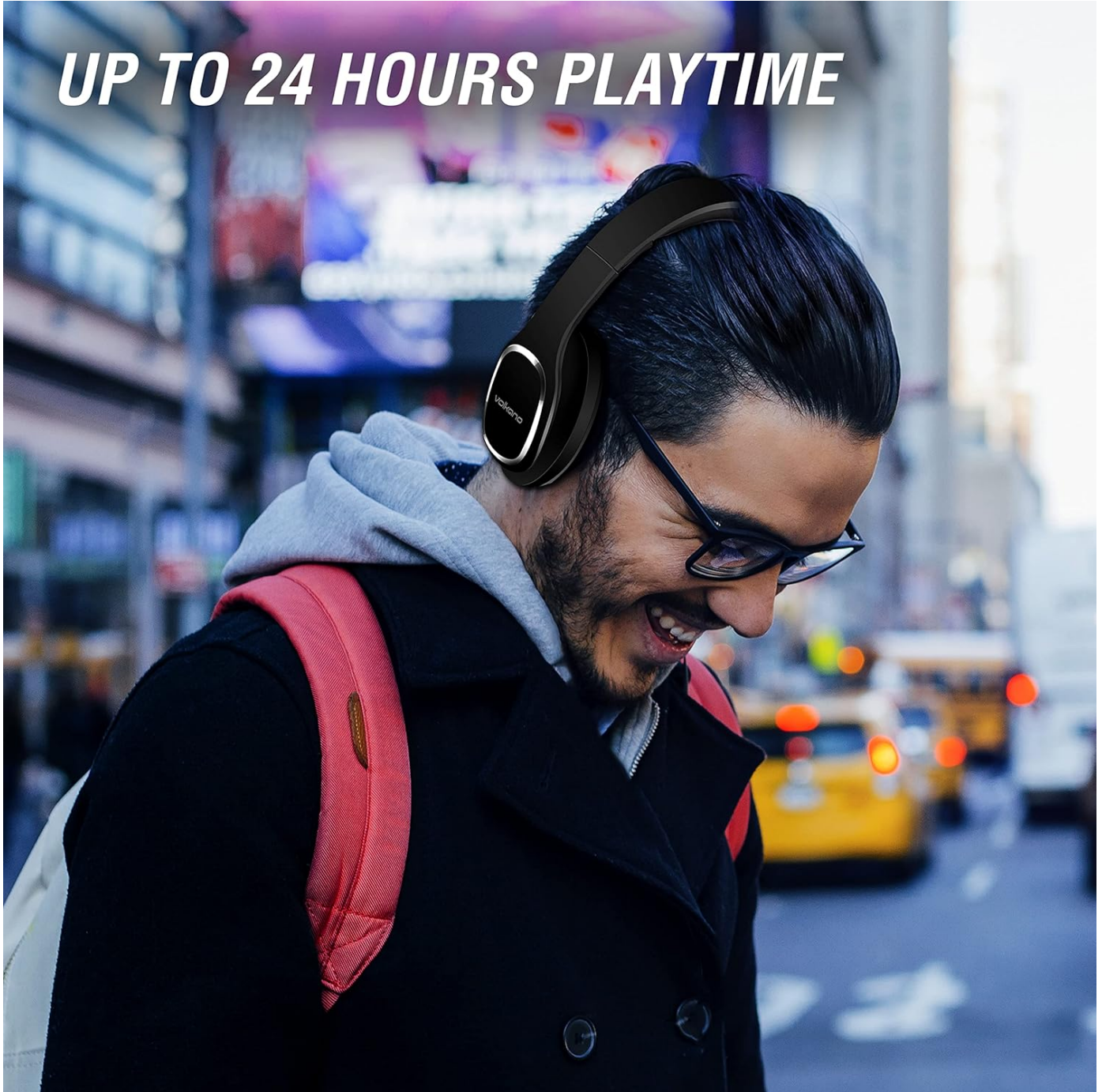
Image: A person wearing the Volkano Phonic Series headphones, illustrating their use for extended periods, highlighting the 24-hour playtime.