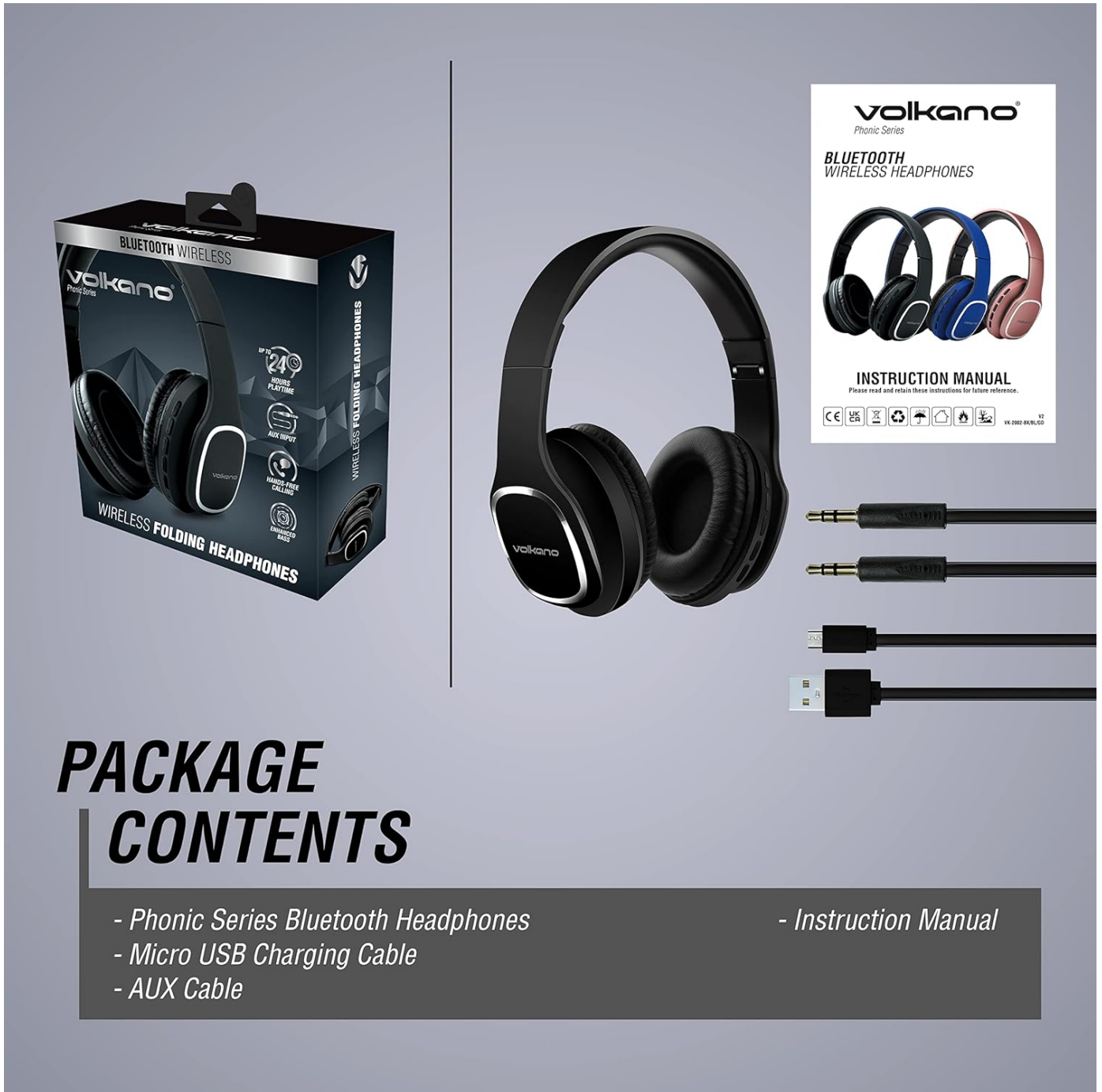
Image: Contents of the Volkano Phonic Series headphone package, including the headphones, cables, and manual.