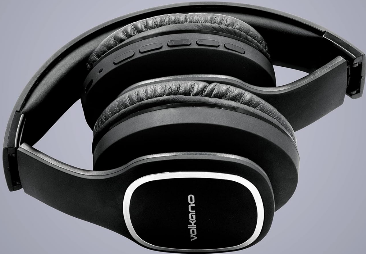
Image: The Volcano Phonic Series headphones shown in their folded position, demonstrating their convenient and portable design.