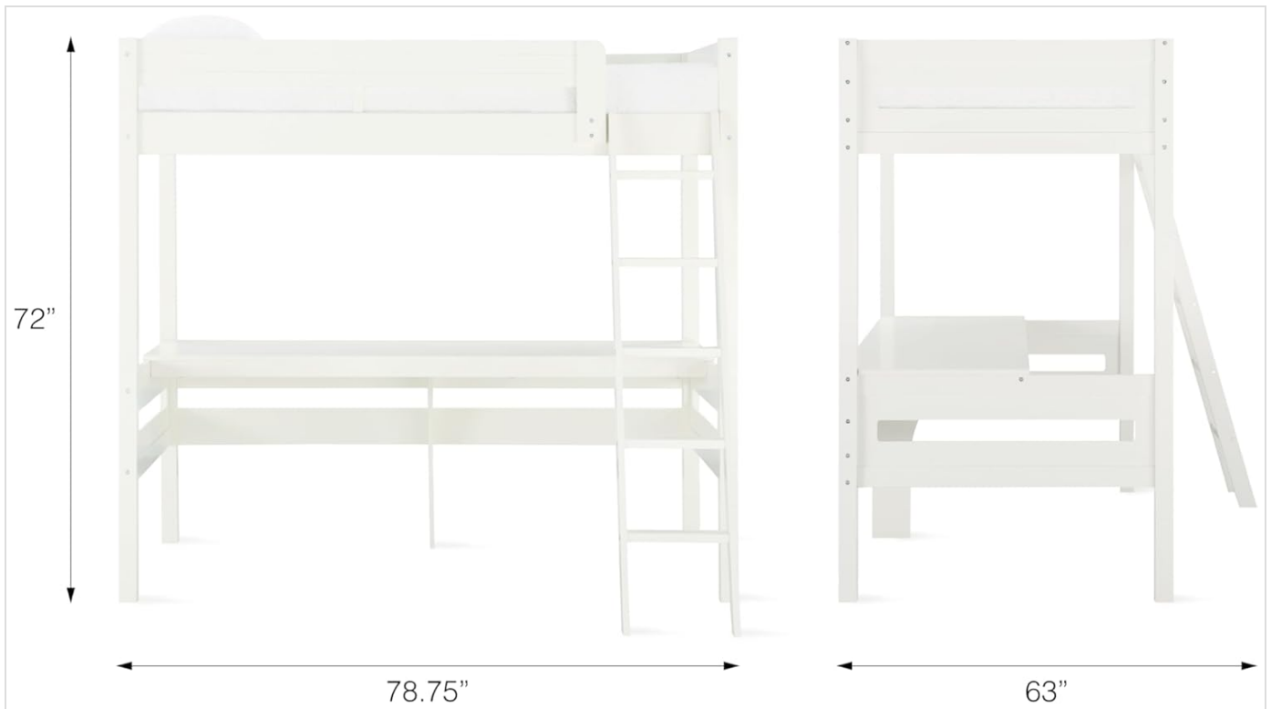
Image: An illustration providing the overall front and side dimensions of the DHP Harlan Loft Bed for spatial planning.