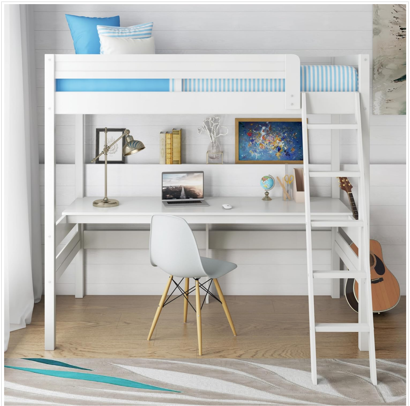
Image: The DHP Harlan Loft Bed with Desk and Ladder, shown in a room setting, highlighting its integrated desk and sleeping area. A laptop, chair, and decorative items are visible on the desk.