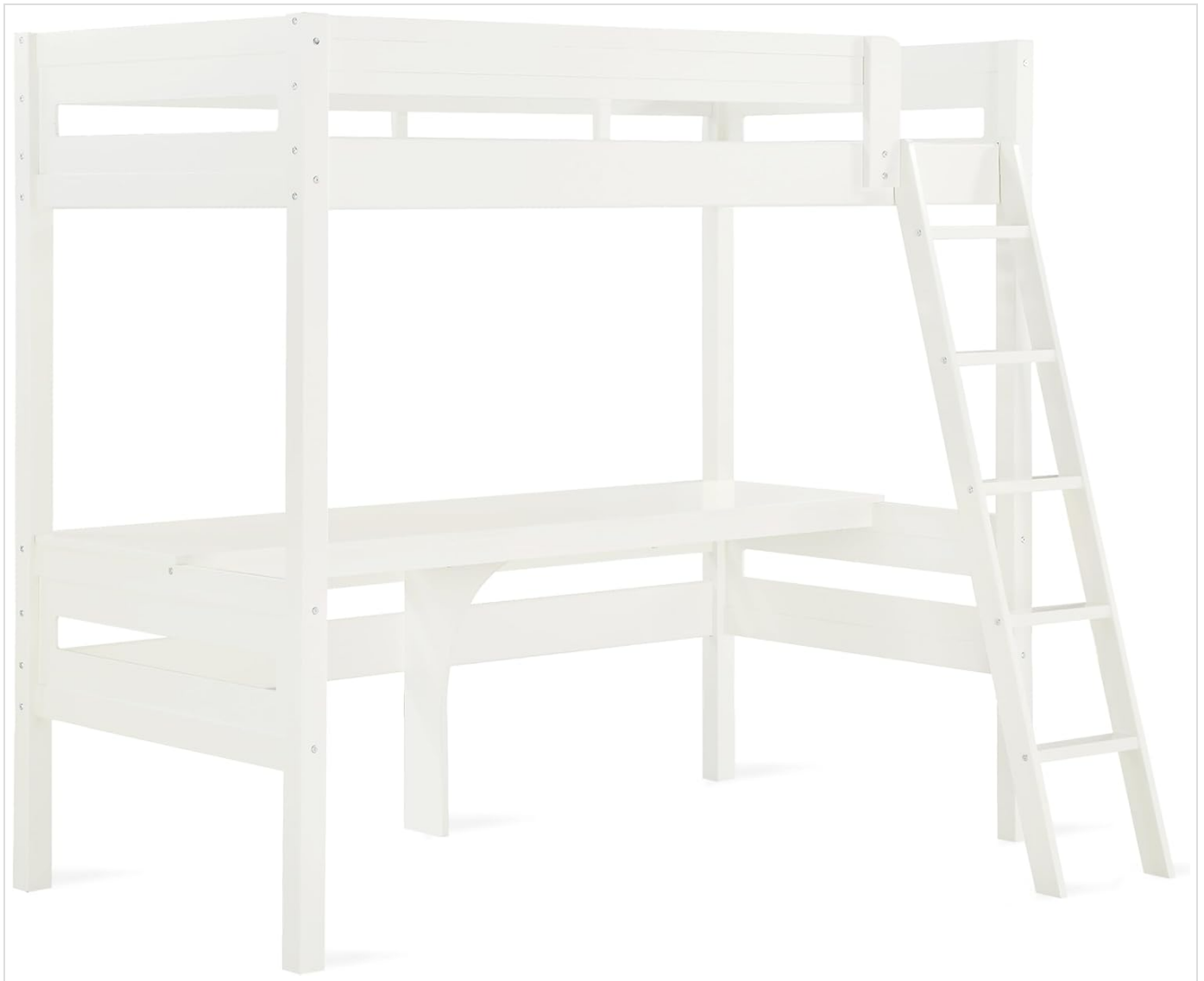
Image: A clear front view of the DHP Harlan Loft Bed, showcasing its structure including the bed frame, integrated desk, and the access ladder.