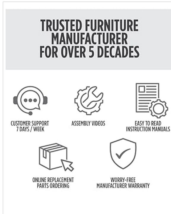
Image: An infographic highlighting DHP's commitment to customer support, including assembly videos, easy instructions, replacement parts, and warranty.