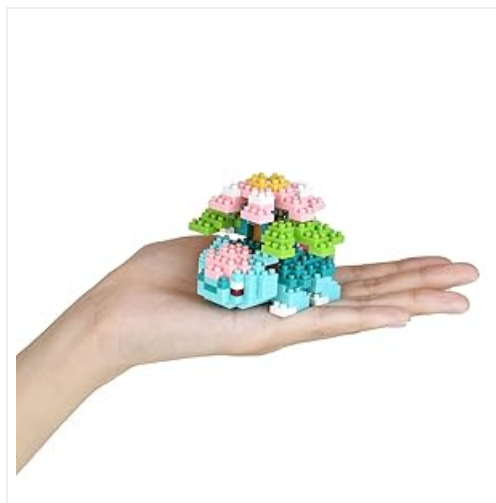
Image 3.1: A nanoblock model, similar in scale to the Black Cat, being held in a person's hand, illustrating the compact and palm-sized nature of the finished product.

Place your finished black cat model on a stable surface. Its compact size allows it to fit in small spaces, such as desks, shelves, or display cabinets.