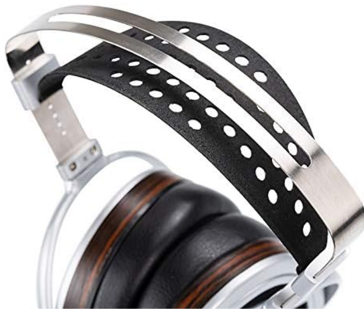
Image: A close-up view of the adjustable headband mechanism and perforated leather strap on the HIFIMAN HE1000se.

The HE1000se features an adjustable headband and asymmetrical ear cups for optimal comfort. Gently slide the ear cups up or down along the metal frame to find a comfortable fit on your head. The perforated leather headband strap distributes weight evenly, and the ear cups are designed to conform to the shape of your ears.