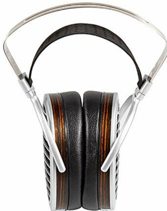
Image: Front view of the HIFIMAN HE1000se headphones, showcasing their silver and wood design with open-back grilles.

The HIFIMAN HE1000se are premium full-size, open-back planar magnetic headphones designed for audiophiles seeking exceptional sound quality and comfort. Featuring advanced acoustic technologies, these headphones deliver a natural, spacious, and detailed listening experience.