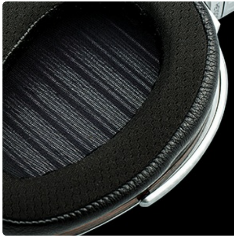
Image: A single ear cup highlighting its asymmetrical shape for improved fit.