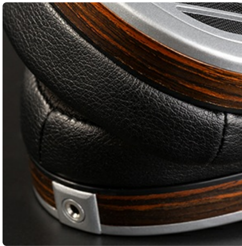
Image: Detail of the headphone's 3.5mm connector port, designed for user-replaceable cables.