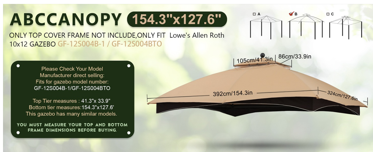
Image: Detailed dimensions and model compatibility for the ABCCANOPY Replacement Canopy Top.

Tip: Keep the installation tool in a safe place for easier removal of the canopy in the future.