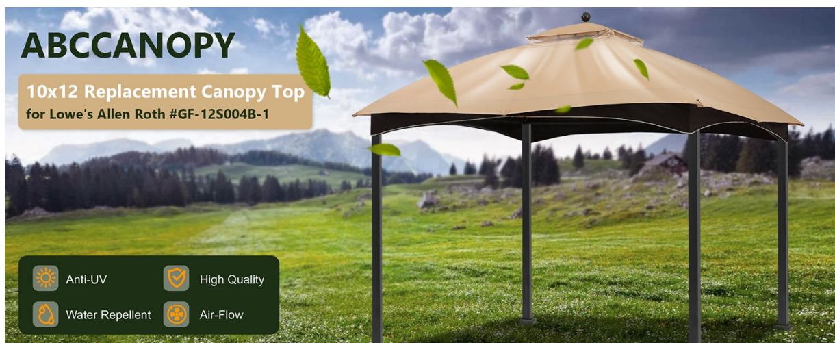
Image: Overview of the ABCCANOPY Replacement Canopy Top, highlighting its features like UV protection, water repellency, high quality, and air-flow design.

Important: This replacement canopy is designed to fit only the specified gazebo models. Please verify your gazebo's model number before installation.