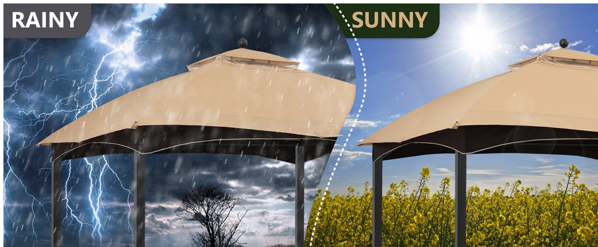
Image: Illustrates the canopy's performance in both sunny and light rainy conditions.