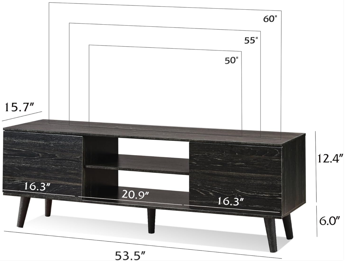
Image: Product dimensions and maximum TV size suitability.