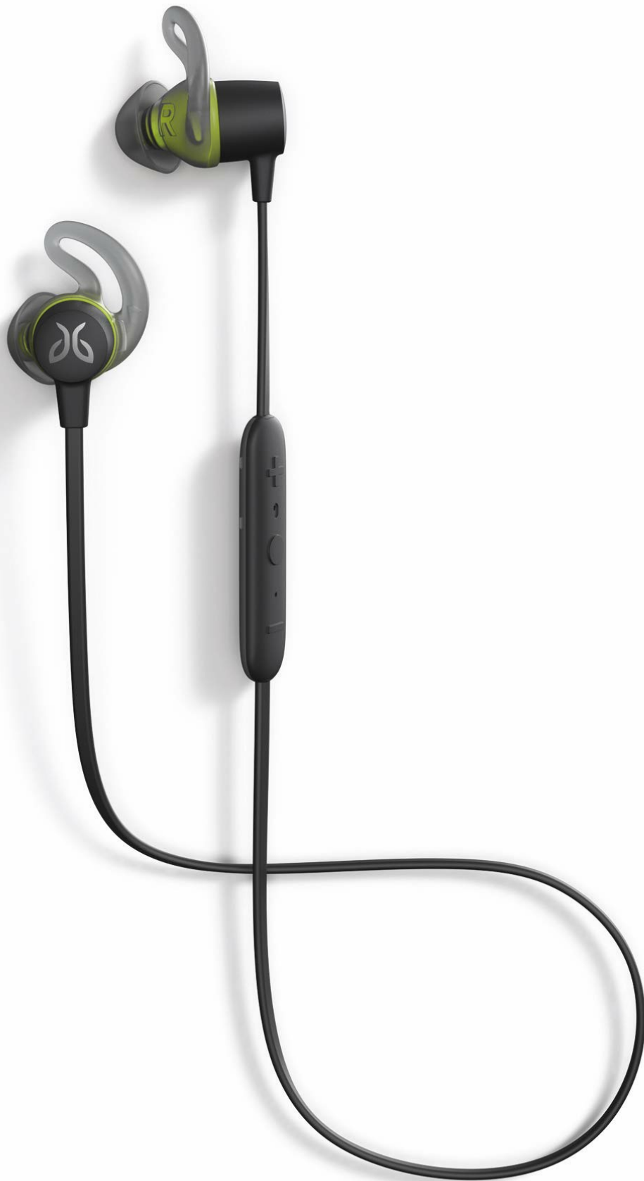
Image: Jaybird Tarah Wireless Sport Headphones in black with green accents.