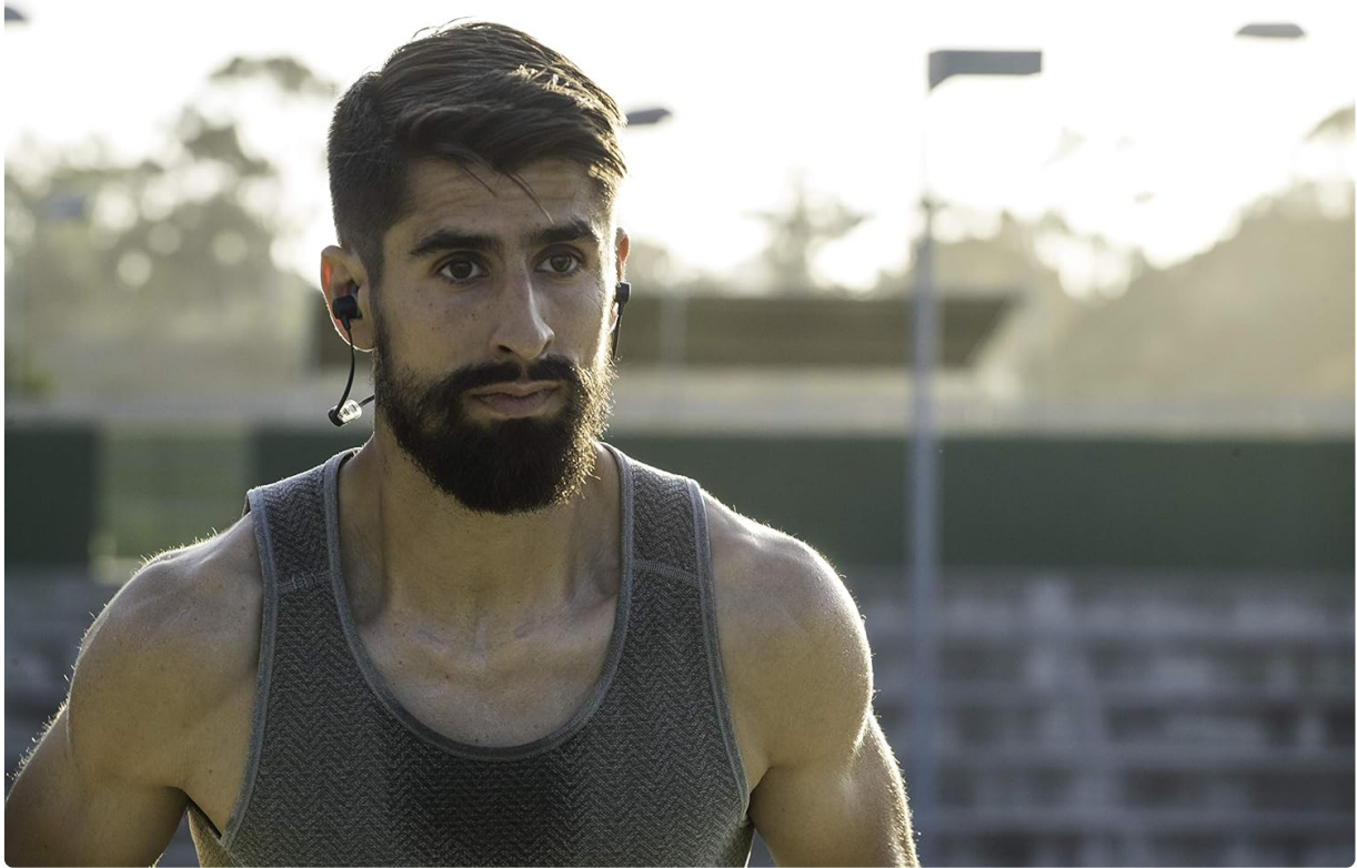
Image: A man wearing Jaybird Tarah headphones, demonstrating the secure sport fit during physical activity.

The Jaybird Tarah headphones come with ultra-soft and flexible silicone ear gels in multiple sizes to ensure a secure and comfortable fit during any activity. The ear gels are designed to provide stability without causing discomfort.