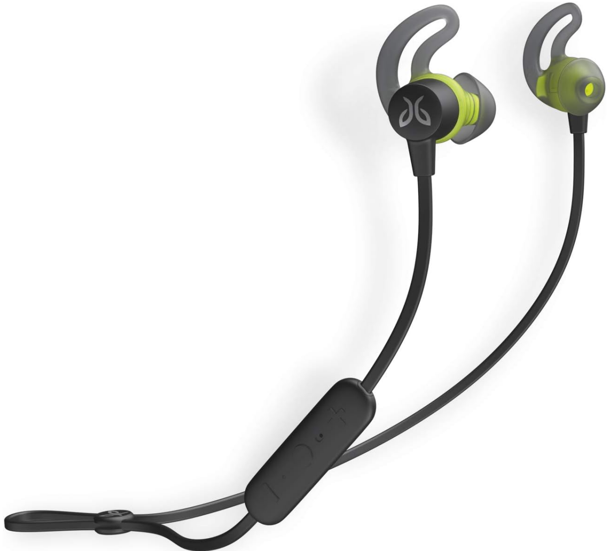
Image: Jaybird Tarah headphones with various ear gel sizes and charging cable.