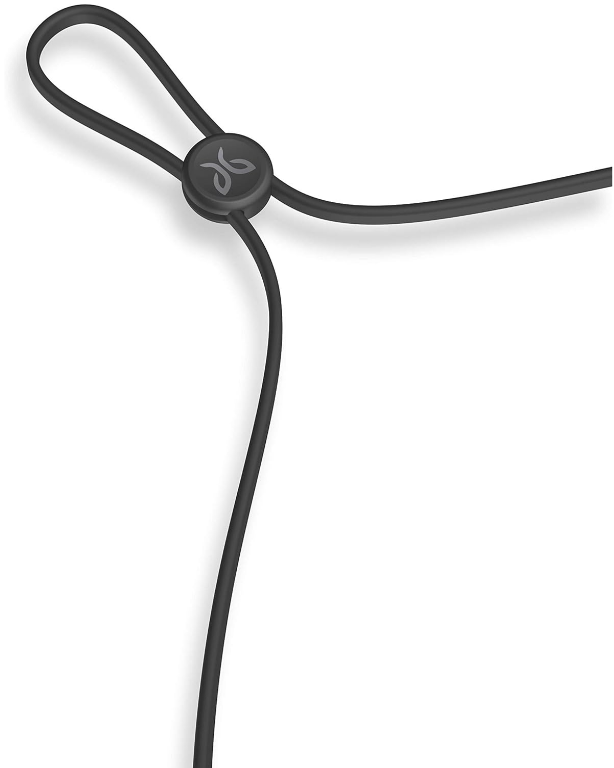
Image: Close-up of the Speed Cinch mechanism on the headphone cable, used for adjusting cable length.