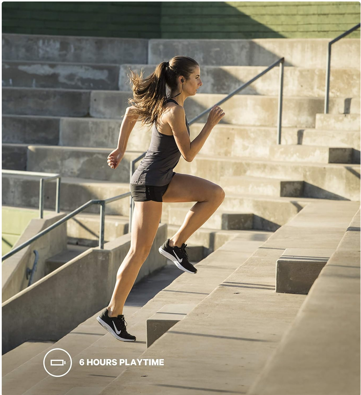
Image: A woman running outdoors, with an overlay indicating "6 HOURS PLAYTIME" for the headphones.