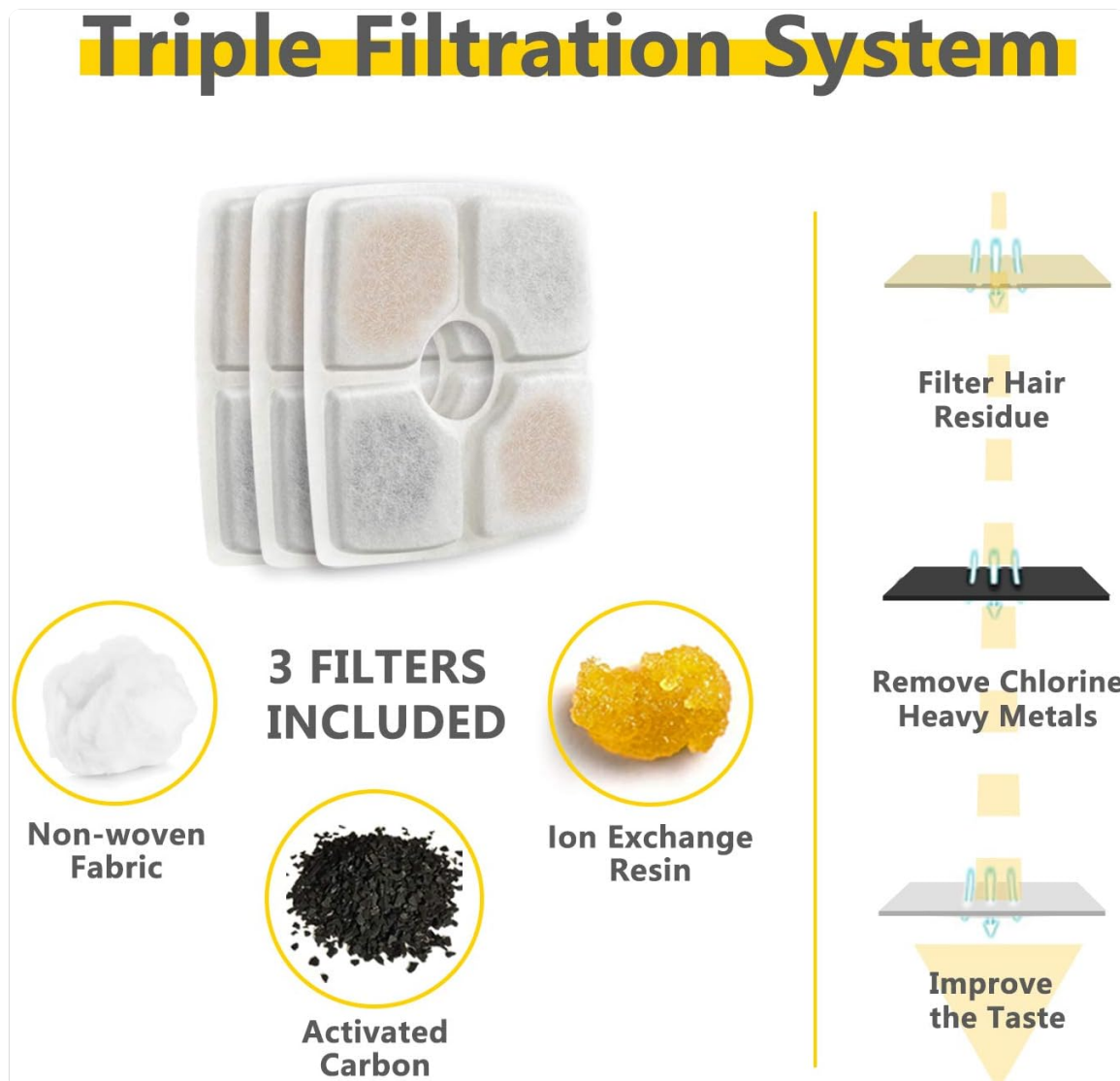
Image: A visual breakdown of the triple filtration system, highlighting the non-woven fabric, activated carbon, and ion exchange resin, and their roles in purifying the water.