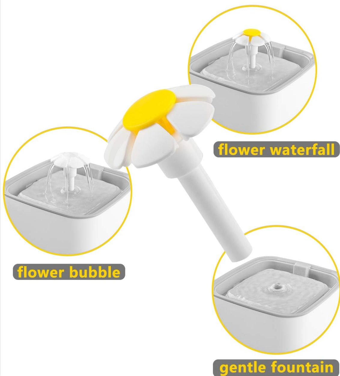
Image: Visual representation of the three distinct water flow options: flower waterfall, flower bubble, and gentle fountain, available with the Veken Pet Fountain.