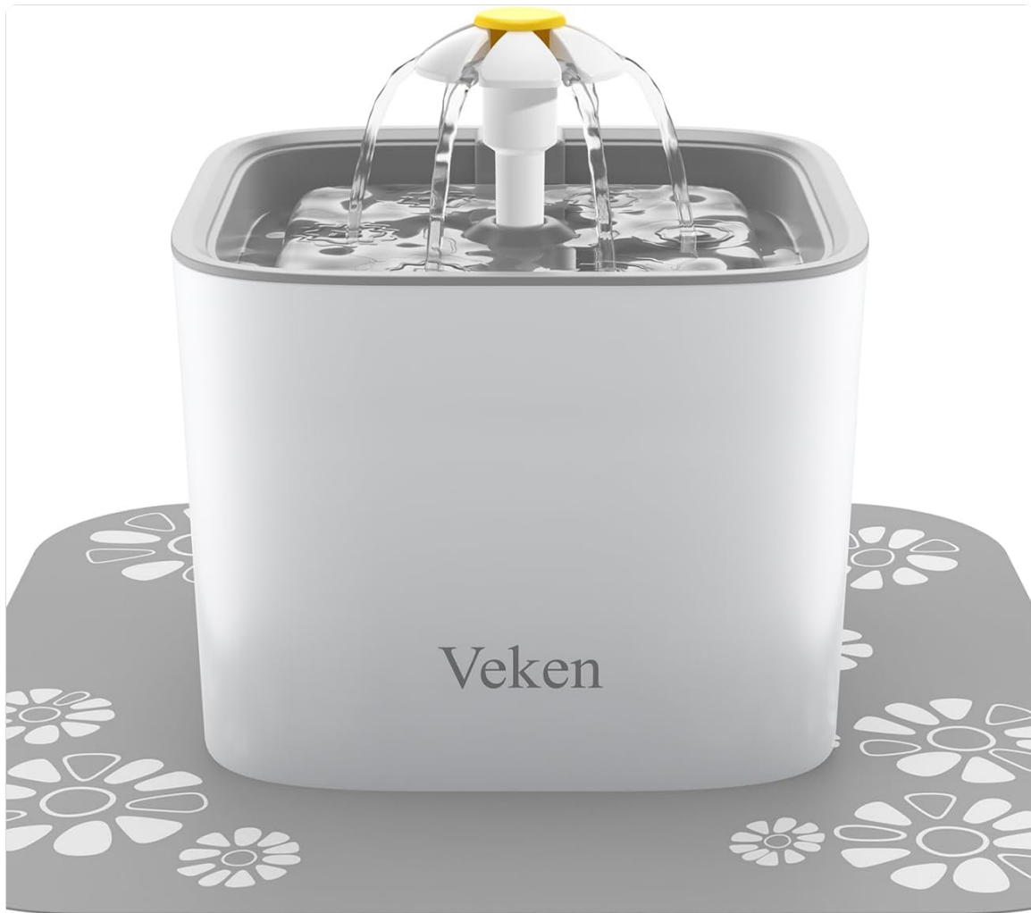
Image: The Veken Pet Fountain, featuring a flower-shaped water spout, positioned on a grey silicone mat with flower patterns.