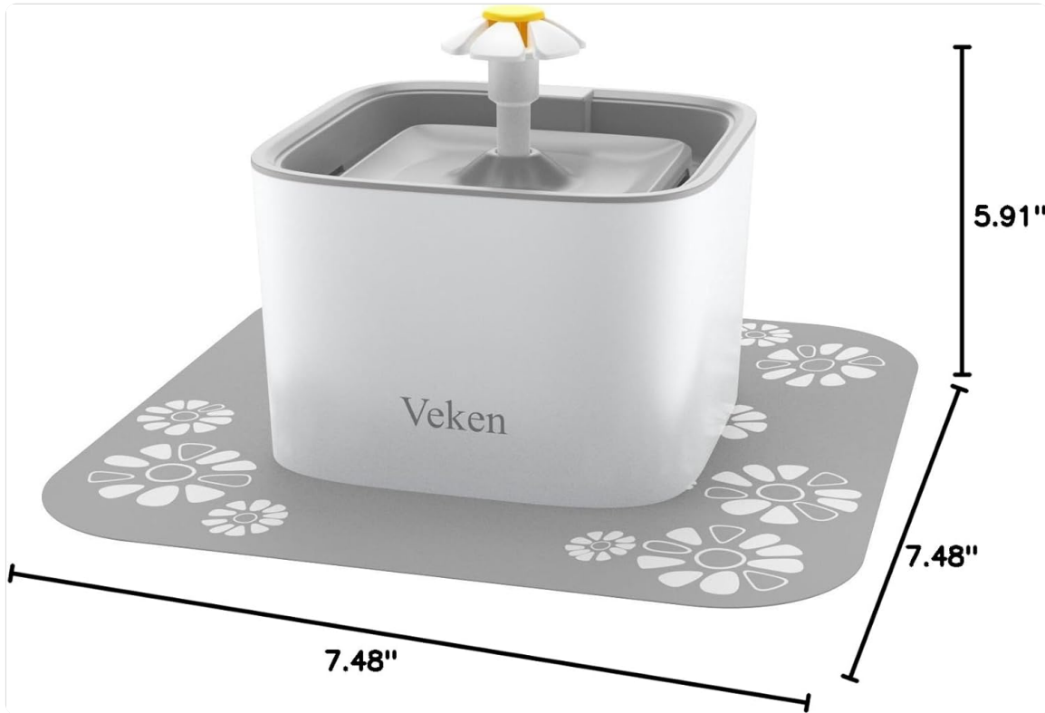
Image: The Veken Pet Fountain with its dimensions clearly marked: 7.48 inches in length and width, and 5.91 inches in height.