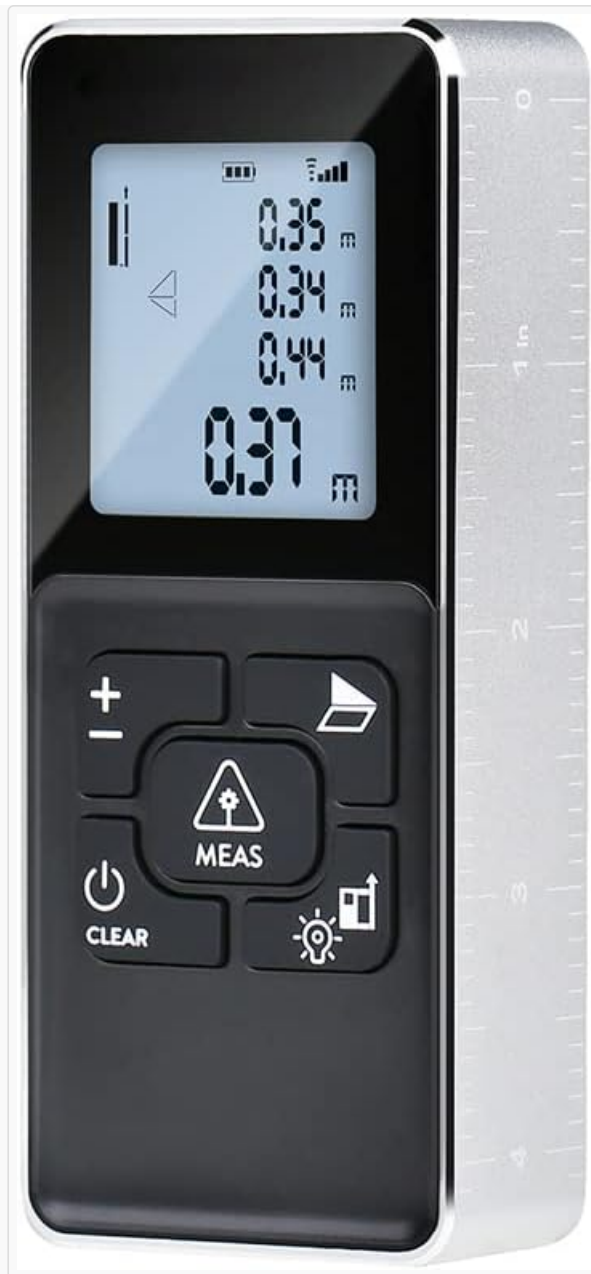
Figure 1: Front view of the TUIREL K100 Laser Distance Measure, showing the display and control buttons.