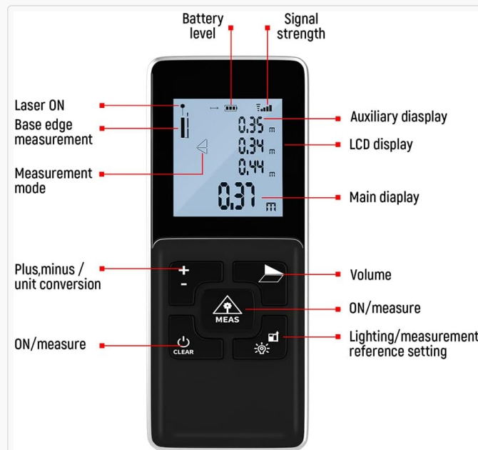
Figure 2: Detailed view of the TUIREL K100 LCD display and button functions, indicating battery level, signal strength, measurement