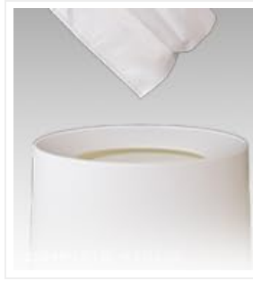
Image: A hand detaching the dust cup from the main unit of the futon cleaner.