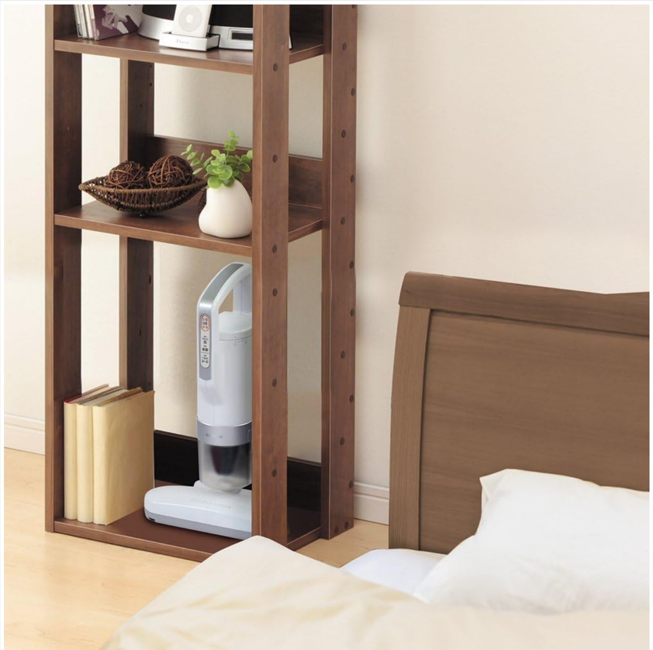
Image: The futon cleaner stored upright in a narrow space next to a bed, showcasing its self-standing capability.