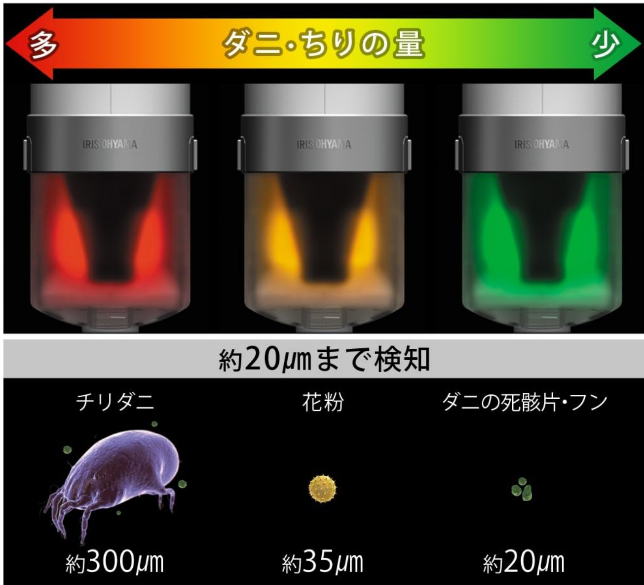
Image: Visual representation of the dust mite sensor, showing red, yellow, and green indicators for dust levels.