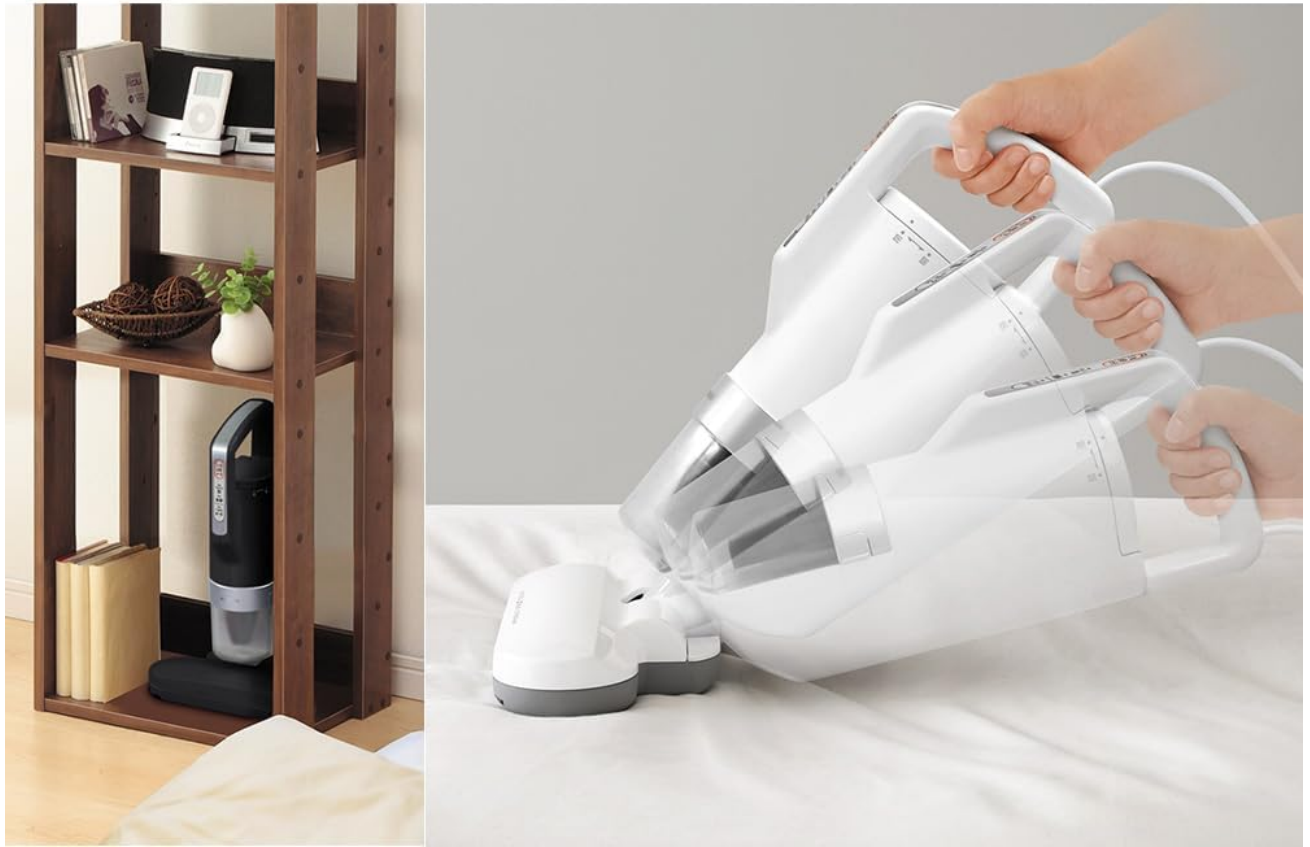
Image: The cleaner demonstrating its movable head for flexible cleaning and its ability to stand upright for storage.

立てて収納も可能な可動式ヘッド。 可動することでデコボコしてるソファやクッションなどもお掃除らくらく!