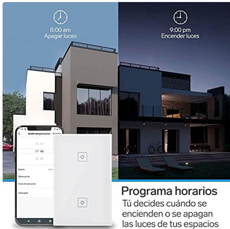
Figure 7: Visual representation of setting schedules for lights to turn on and off automatically using the app.