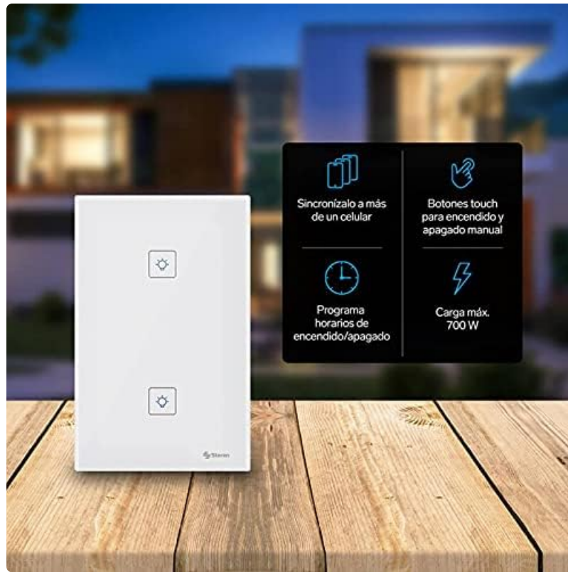
Figure 2: Overview of the STEREN SHOME-110's main features.