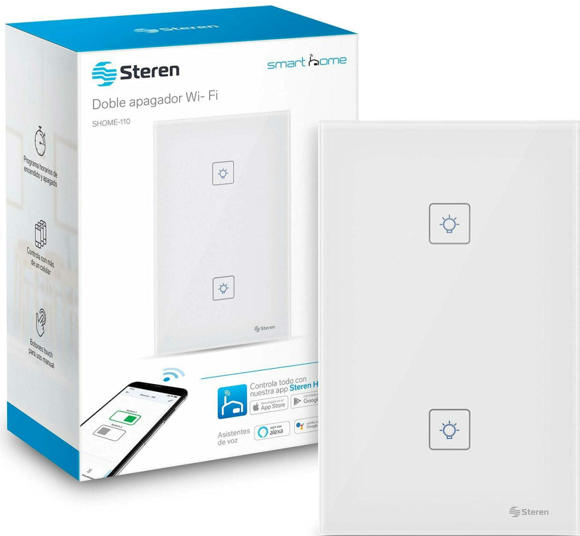
Figure 1: Front view of the STEREN SHOME-110 Dual Wi-Fi Touch Switch.