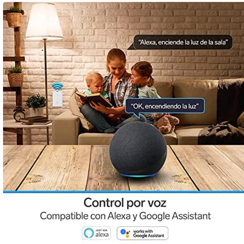
Figure 6: Demonstrates voice control functionality of the STEREN SHOME-110 switch using Amazon Alexa or Google Assistant.

Open the "Smart Life - Smart Living" app. You will see the named switches. Tap on a switch icon to toggle the corresponding light ON or OFF. You can also rename the switches within the app for easier identification (e.g., "Living Room Light 1", "Kitchen Light").