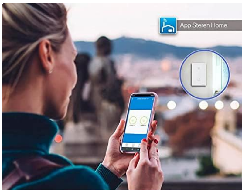
Figure 4: Screenshot of the app interface showing the configuration process for the STEREN SHOME-110 switch.

Establece fácilmente el comportamiento de la iluminación inteligente para tu casa y oficina, usando nuestra app Steren Home