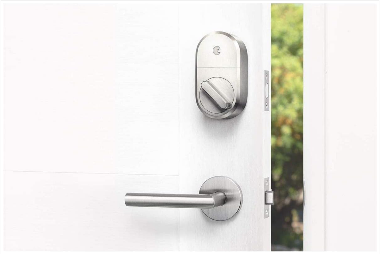
Image: Exterior view of a door with a standard deadbolt, compatible with August Smart Lock.