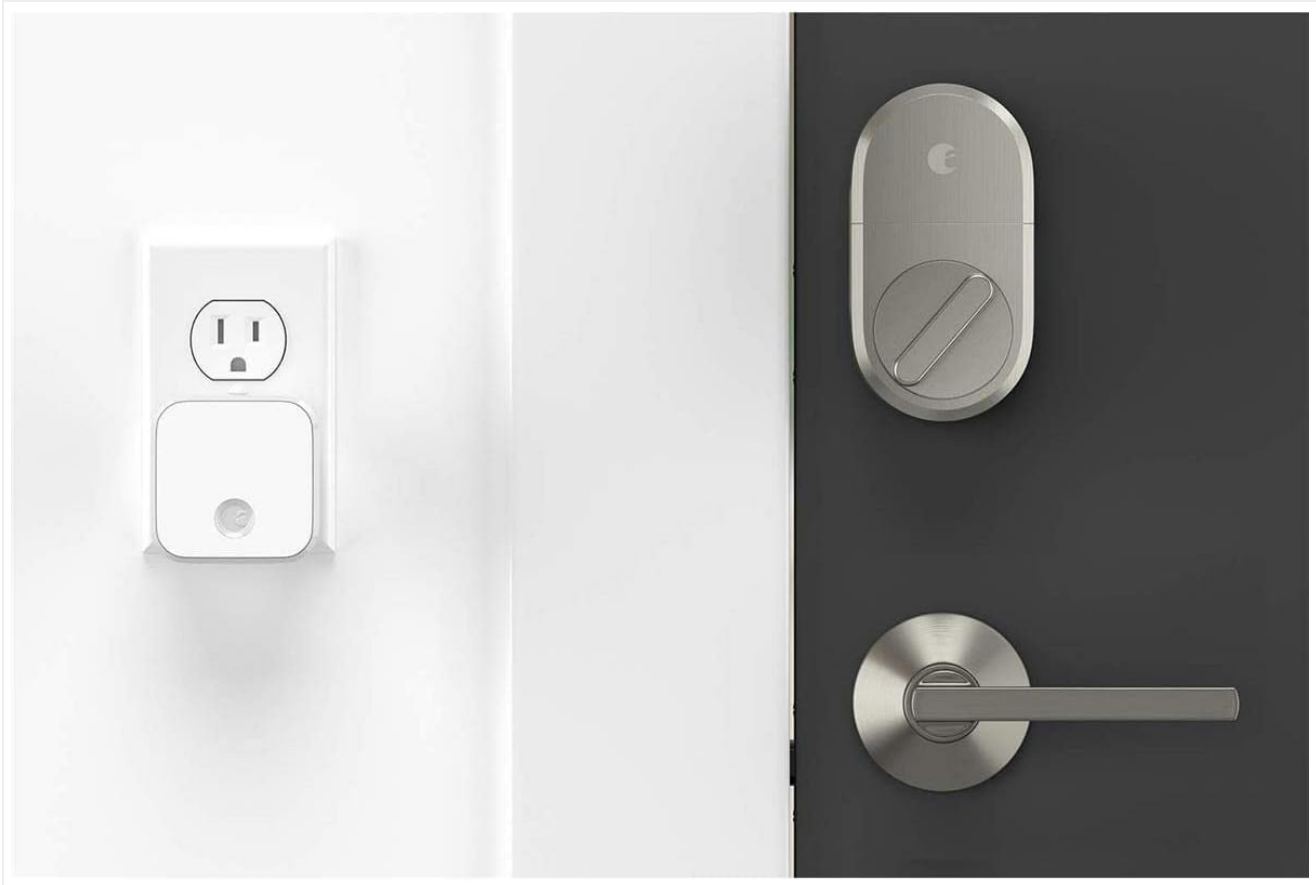
Image: August Smart Lock and Connect Wi-Fi Bridge plugged into an outlet.