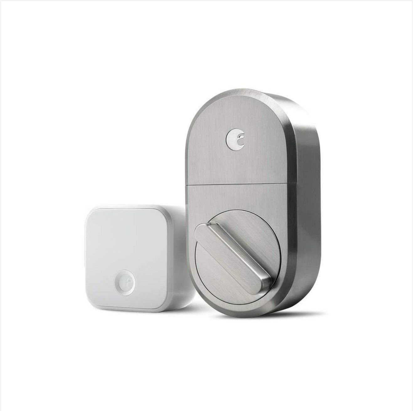
Image: August Smart Lock and Connect Wi-Fi Bridge components in packaging.