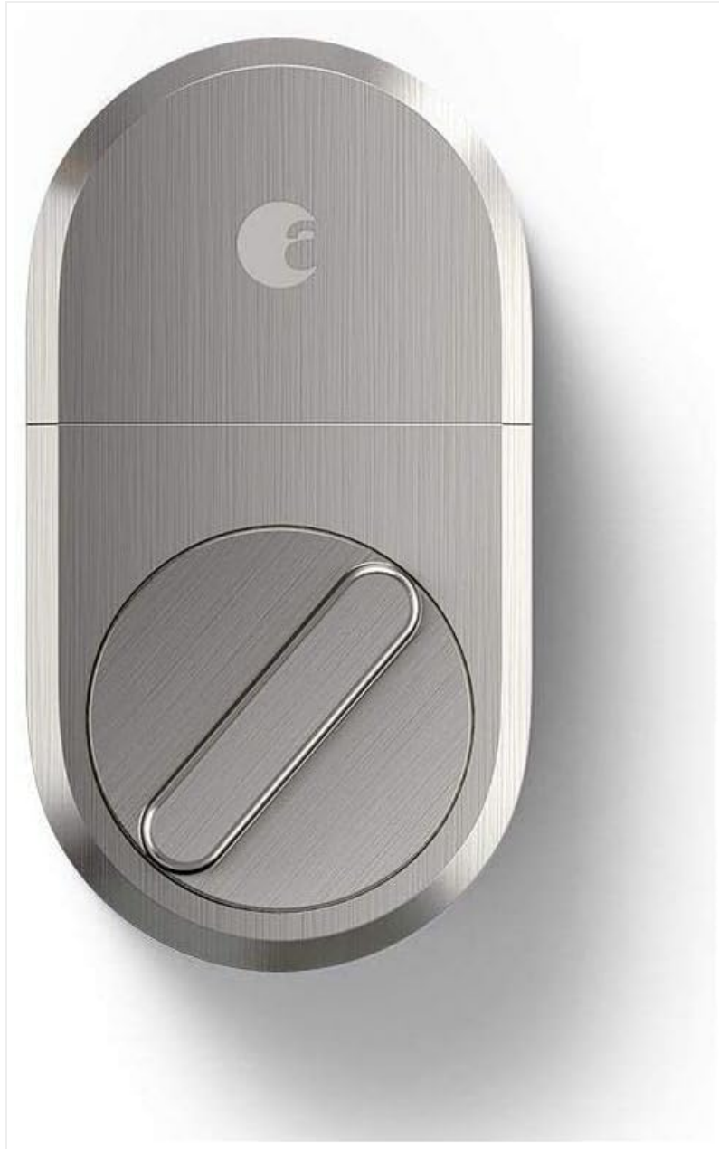
Image: August Smart Lock installed on the interior side of a door.